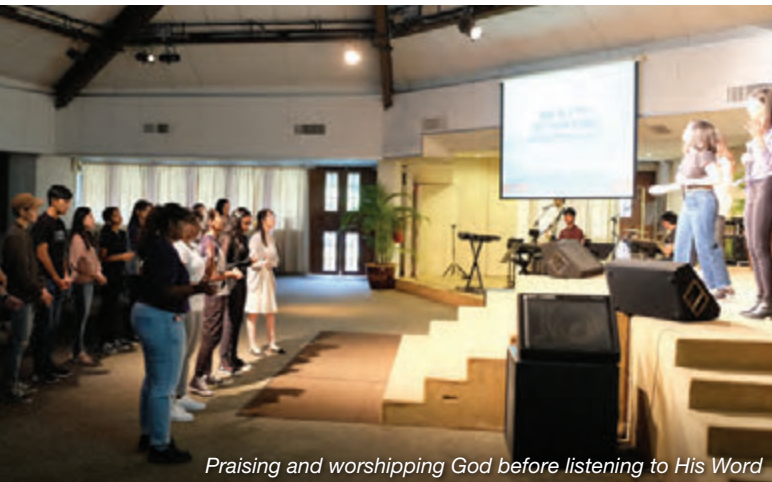
Praising and worshipping God before listening to His Word

For more information on the Calvary Youth Fellowship, call 03-8999 5532 ext. 442.