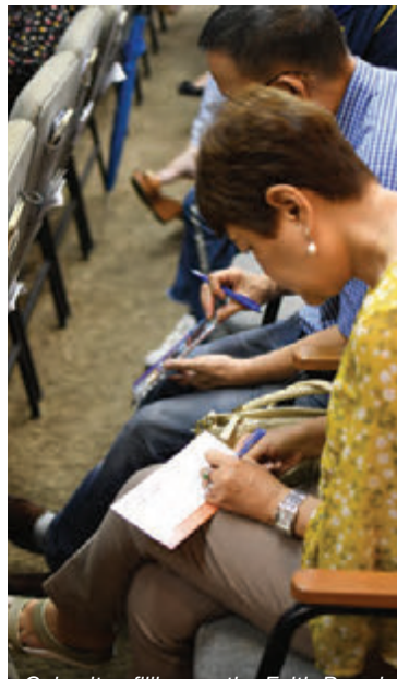
Calvarites filling up the Faith Promise cards at DH

Praise God for each individual who responded in faith during Missions Emphasis!