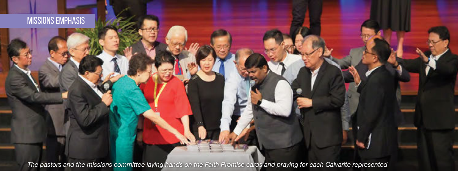
The pastors and the missions committee laying hands on the Faith Promise cards and praying for each Calvarite represented