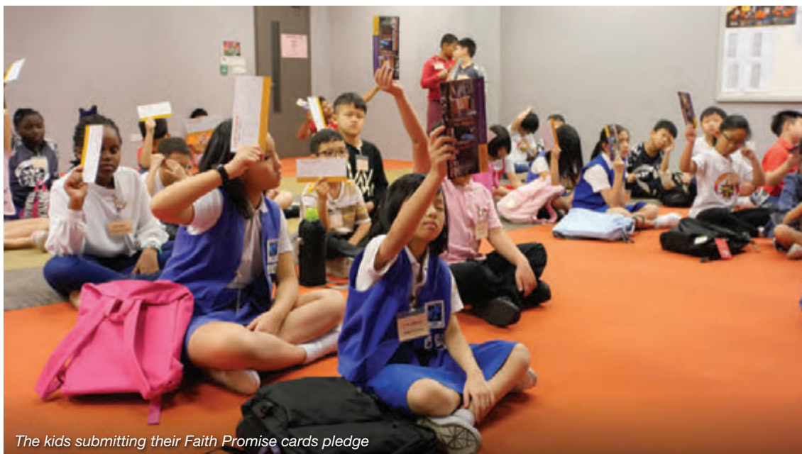
The kids submitting their Faith Promise cards pledge