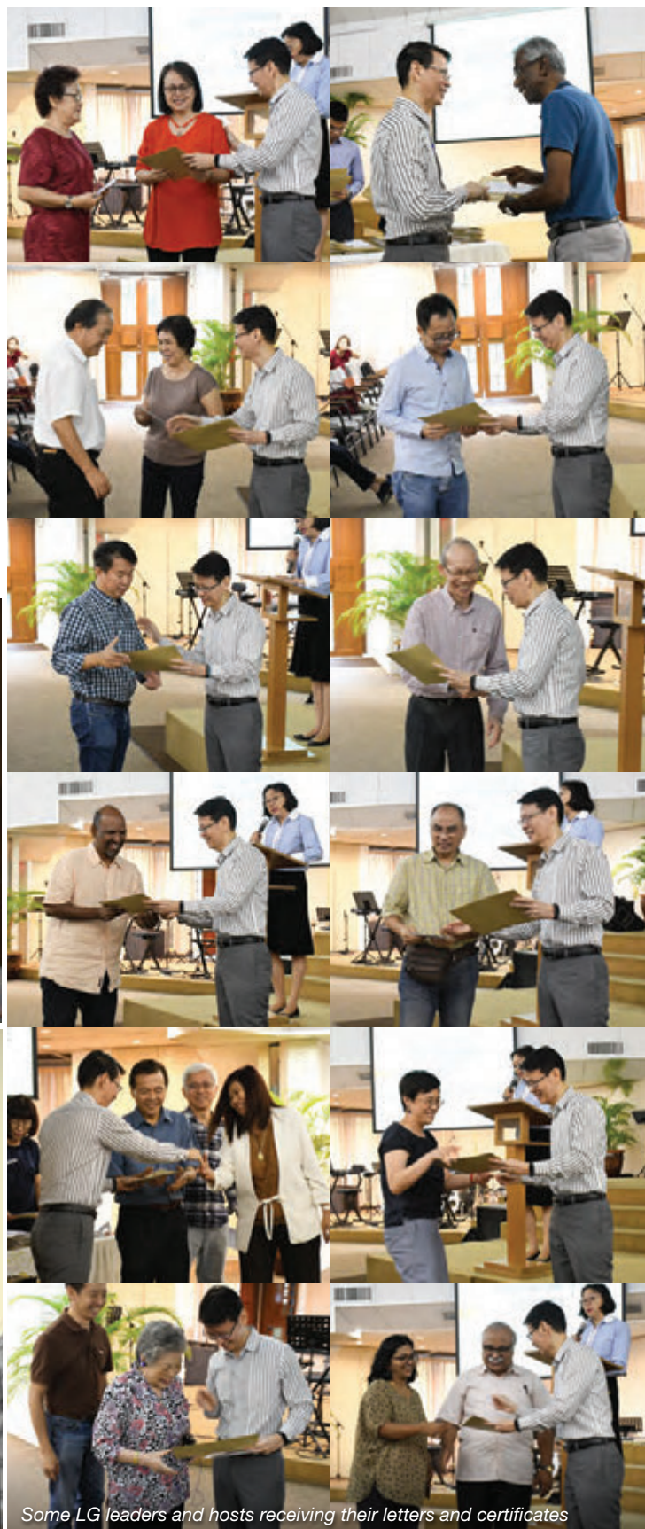
Some LG leaders and hosts receiving their letters and certificates