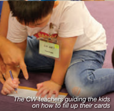
The CW teachers guiding the kids on how to fill up their cards