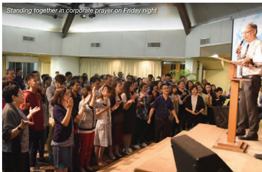
Standing together in corporate prayer on Friday night