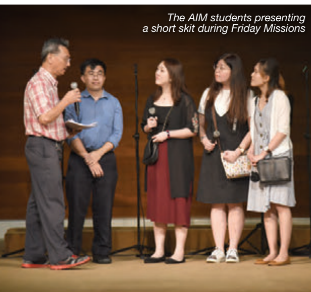
The AIM students presenting a short skit during Friday Missions

Drawing from Ecclesiastes 2:4-11 during the worship services on Saturday evening and Sunday morning, we looked at Solomon's reflection upon the abundant material wealth he had amassed, where he felt he had been chasing the wind. While God richly provides