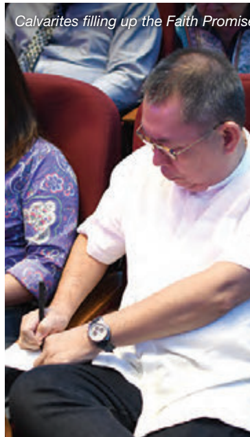
Calvarites filling up the Faith Promise cards at CCC