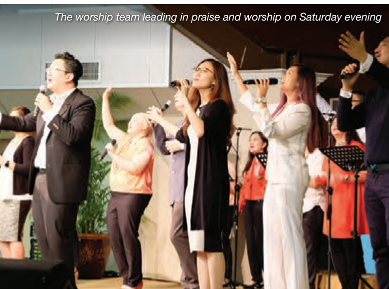
The worship team leading in praise and worship on Saturday evening