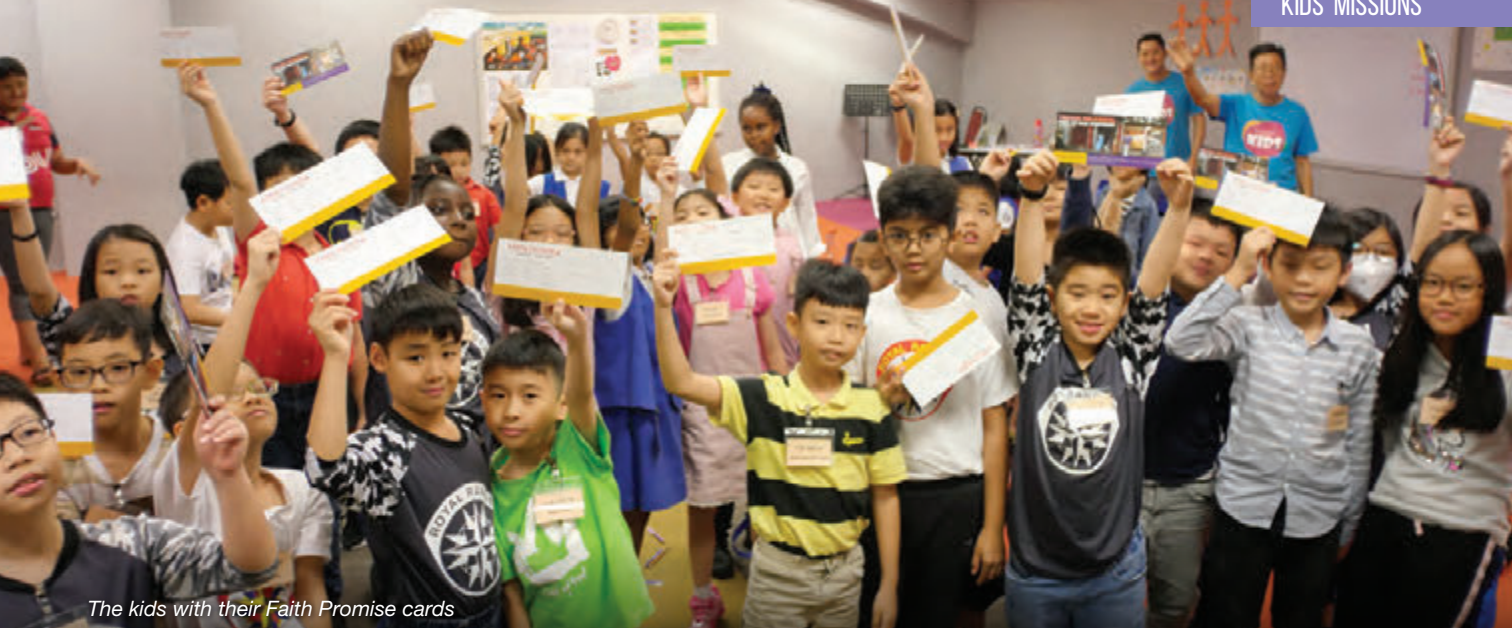
The kids with their Faith Promise cards