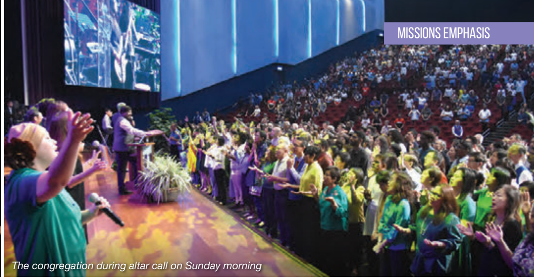
The congregation during altar call on Sunday morning

everything for us to enjoy, we must not value ourselves based on our wealth or possessions. We brought nothing into this world, and will bring nothing with us when we leave. What is of importance is for us to realise the great value of the Kingdom of God, and to radically reprioritise our lives to build His Kingdom.