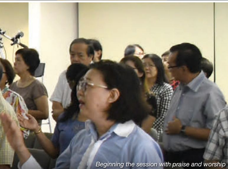
Beginning the session with praise and worship