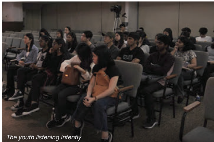
The youth listening intently