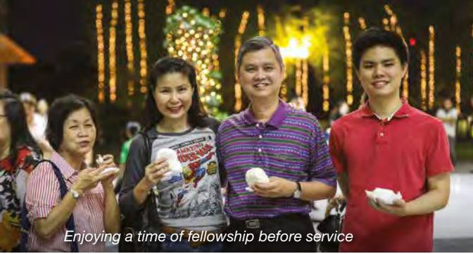
Enjoying a time of fellowship before service