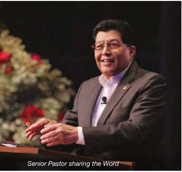
Senior Pastor sharing the Word