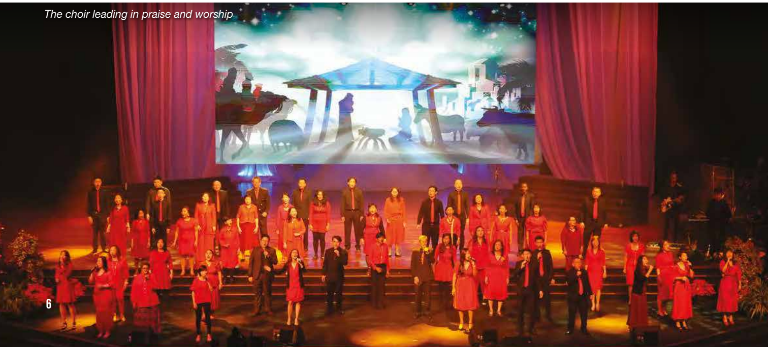
The choir leading in praise and worship