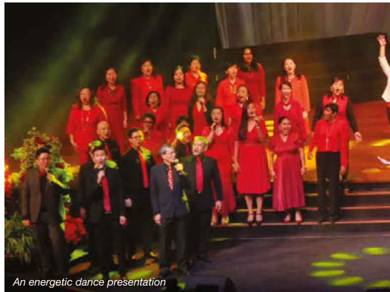
An energetic dance presentation