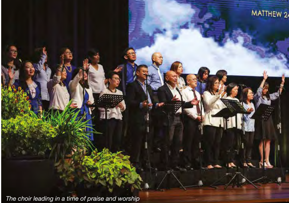
The choir leading in a time of praise and worship