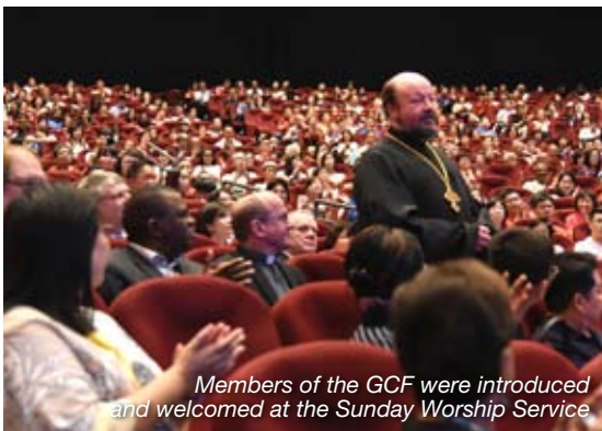
Members of the GCF were introduced and welcomed at the Sunday Worship Service