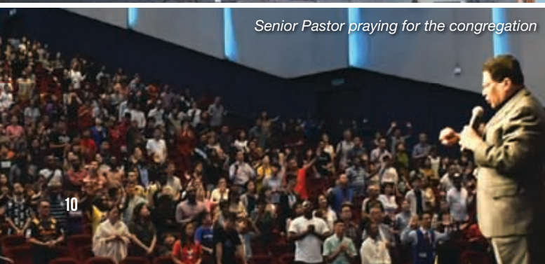
Senior Pastor praying for the congregation