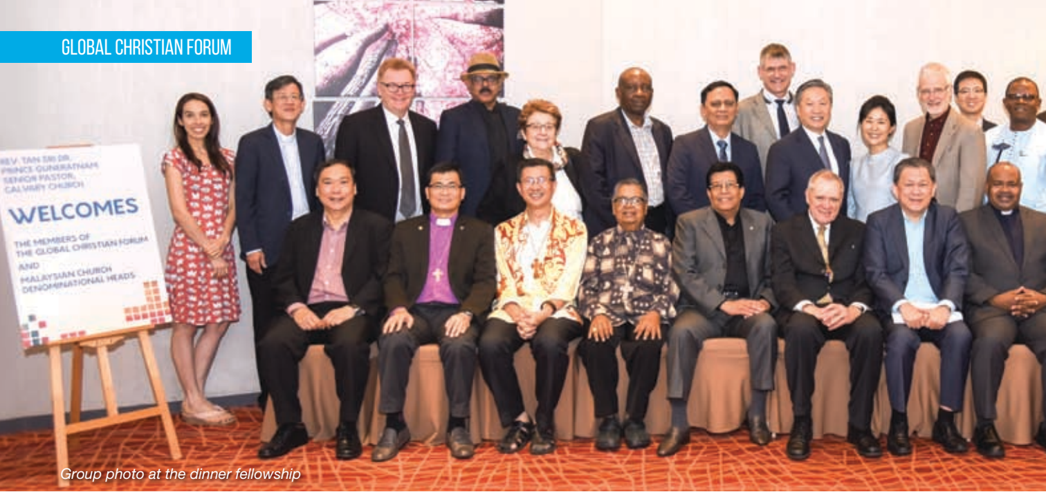
Group photo at the dinner fellowship