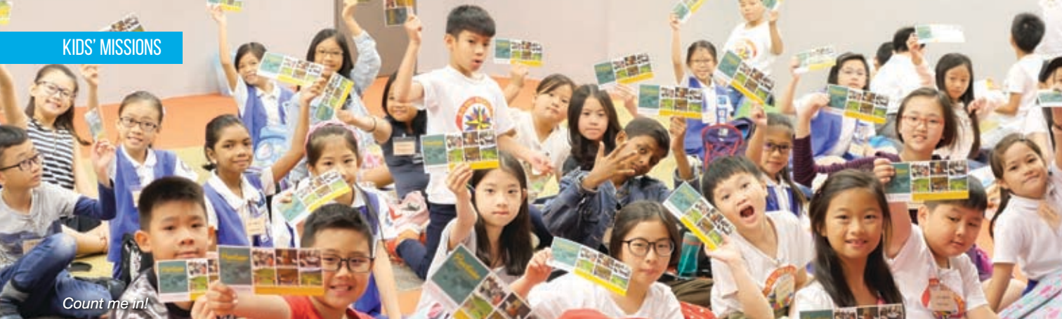
Count me in!