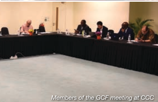
Members of the GCF meeting at CCC