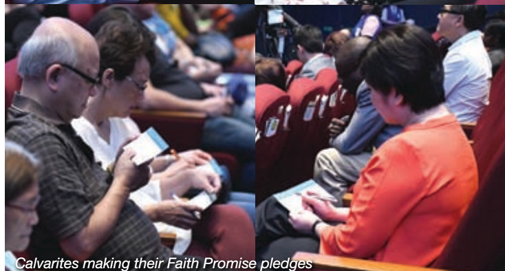
Calvarites making their Faith Promise pledges