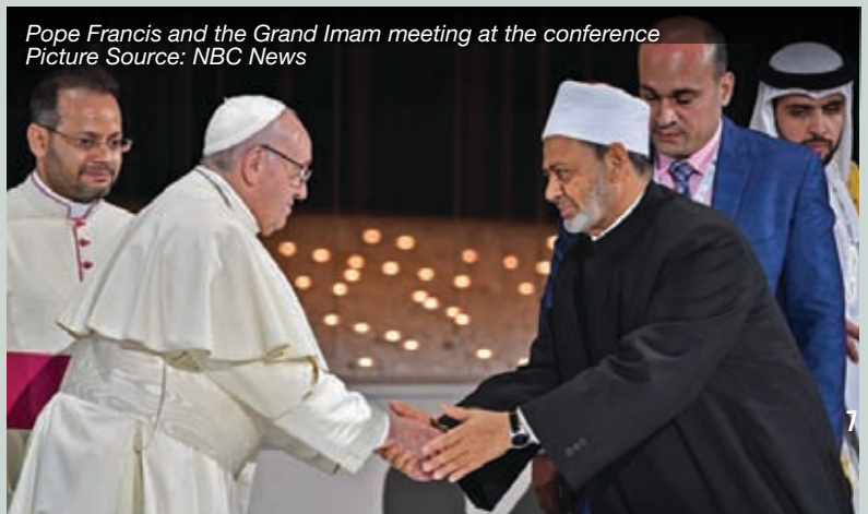
Pope Francis and the Grand Imam meeting at the conference