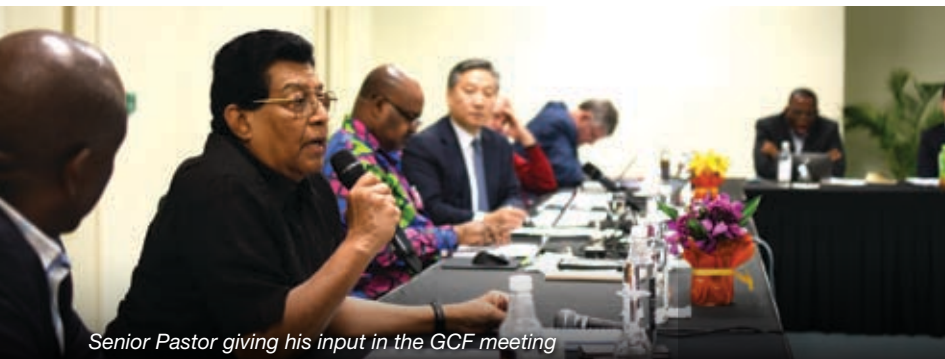
Senior Pastor giving his input in the GCF meeting