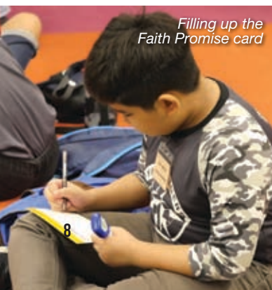
Filling up the Faith Promise card