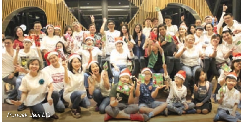
Puncak Jalil LG