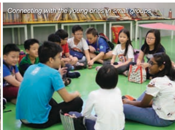
Connecting with the young ones in small groups