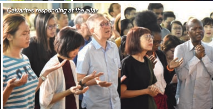
Calvarites responding at the altar