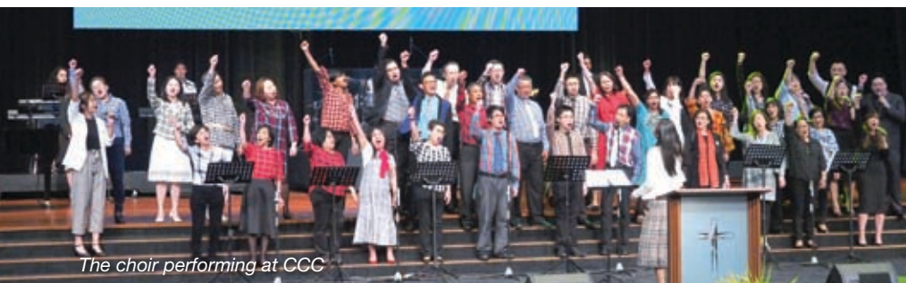
The choir performing at CCC

At the Saturday Worship Service at Calvary Damansara Heights and Sunday Worship Service at Calvary