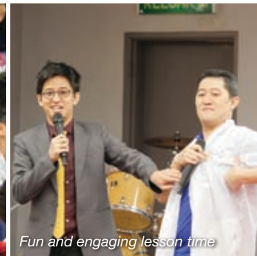
Fun and engaging lesson time