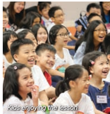
Kids enjoying the lesson

On Saturday and Sunday, the kids were challenged to trust God through the leading of the Holy Spirit to be active witnesses for Christ. They were all given an opportunity to participate in Faith Promise from January to June 2019. Their giving will help them to grow in faith and proclaim the Gospel of Christ to the lost.