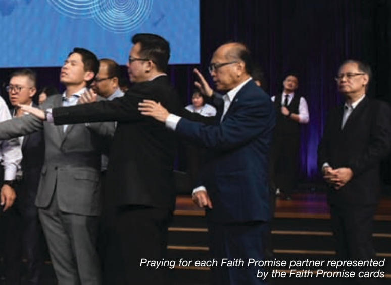
Praying for each Faith Promise partner represented by the Faith Promise cards