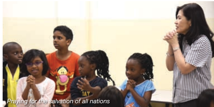
Praying for the salvation of all nations