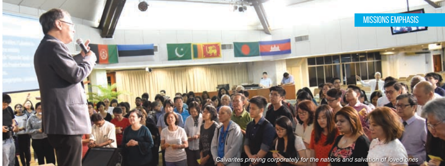
Calvarites praying corporately for the nations and salvation of loved ones