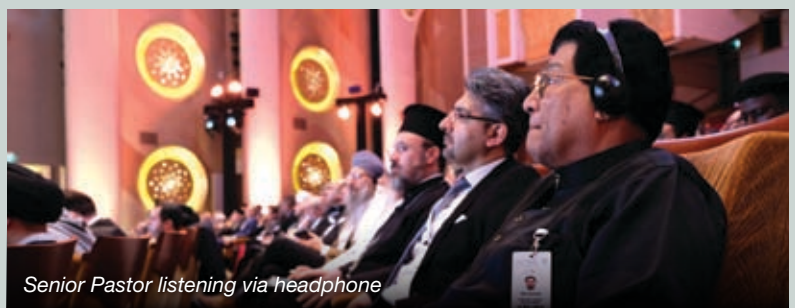
Senior Pastor listening via headphone