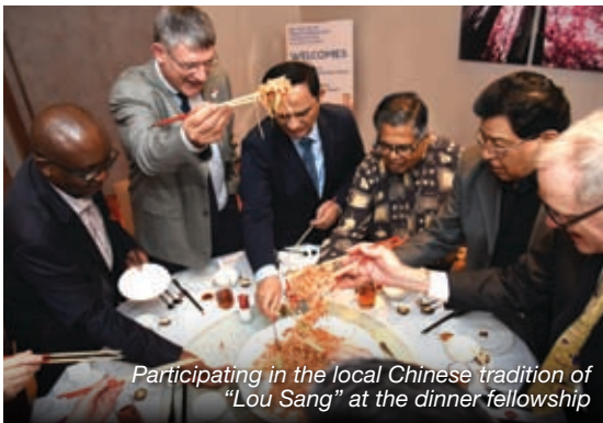
Participating in the local Chinese tradition of “Lou Sang” at the dinner fellowship