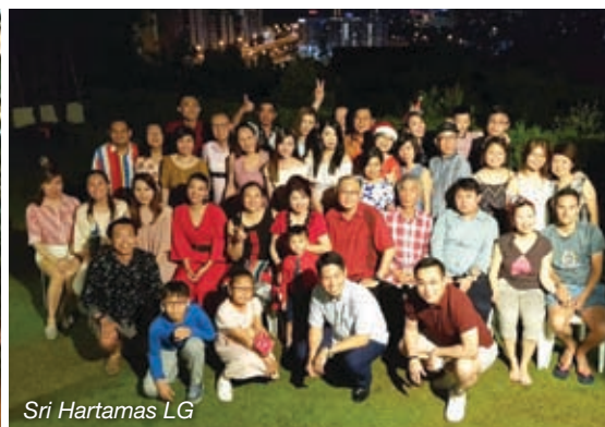
Sri Hartamas LG