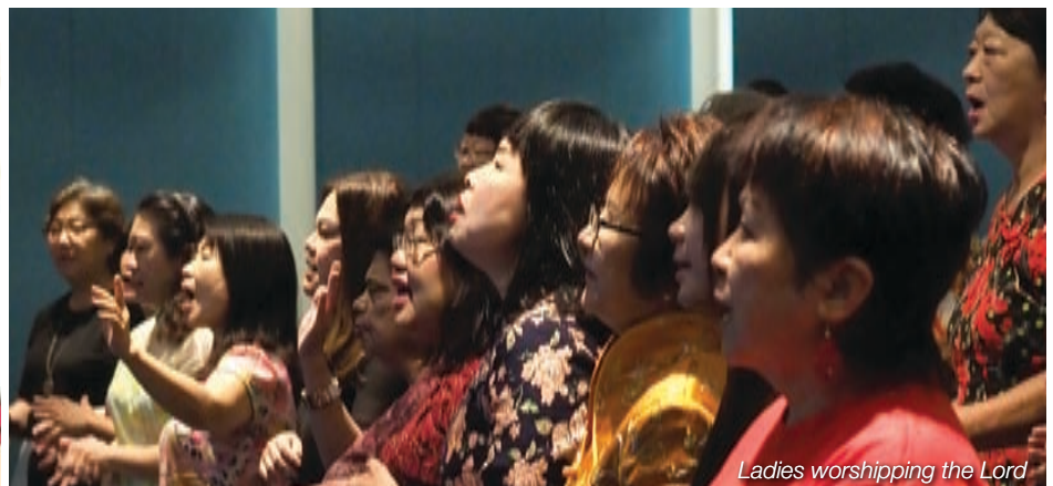
Ladies worshipping the Lord