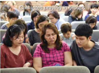
Calvarites praying in groups