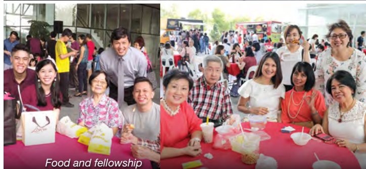
Food and fellowship