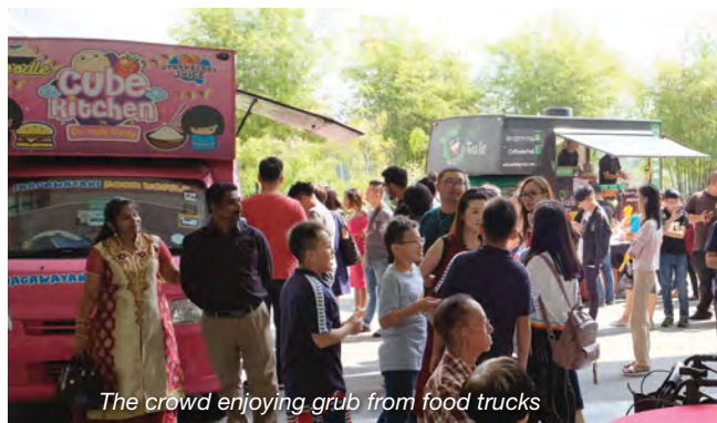
The crowd enjoying grub from food trucks