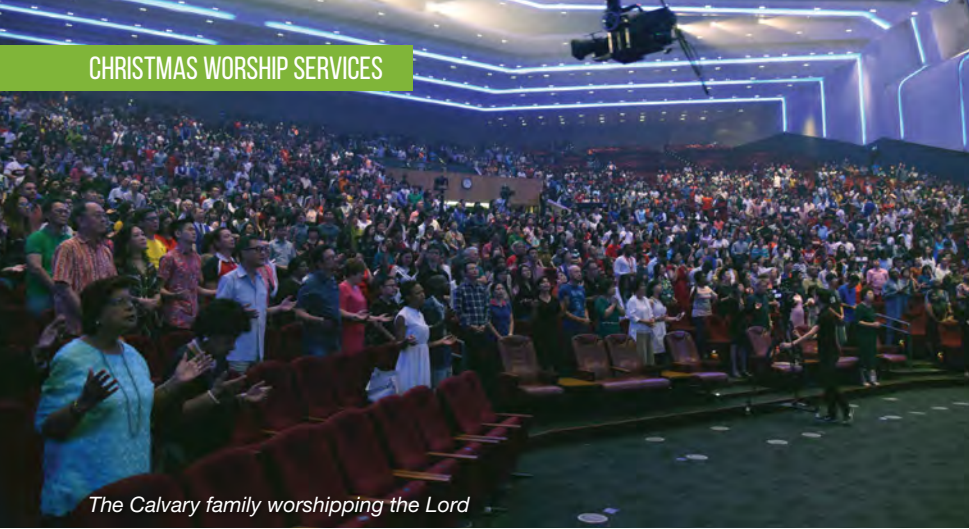
The Calvary family worshipping the Lord