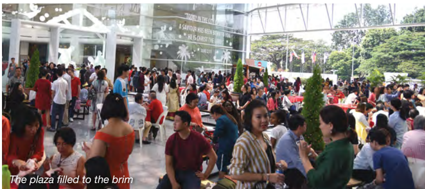
The plaza filled to the brim