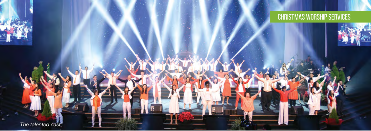
The talented cast