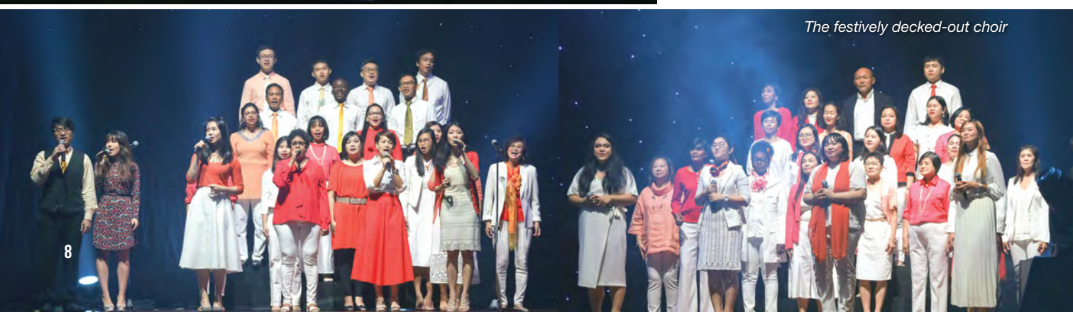
The festively decked-out choir