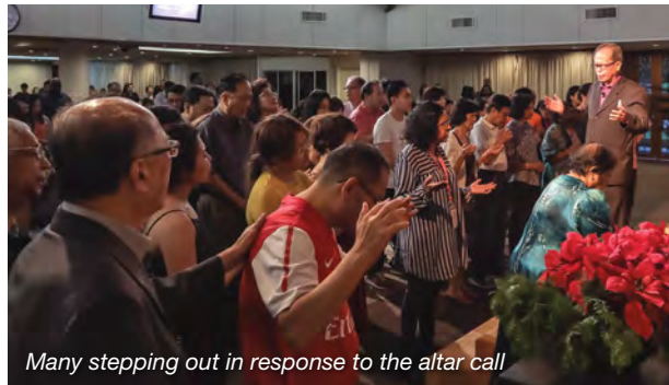
Many stepping out in response to the altar call