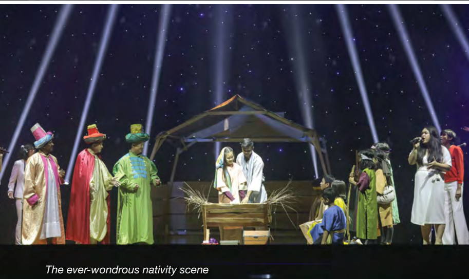
The ever-wondrous nativity scene