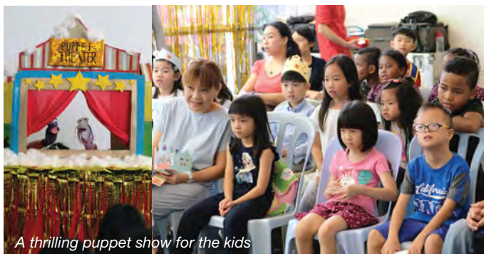
A thrilling puppet show for the kids