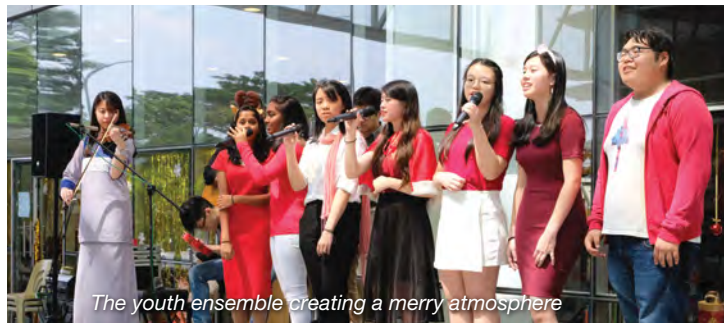
The youth ensemble creating a merry atmosphere