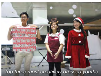
Top three most creatively dressed youths