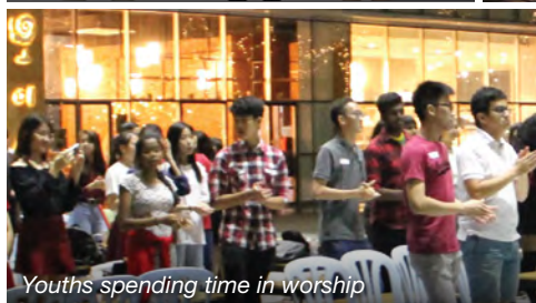
Youths spending time in worship