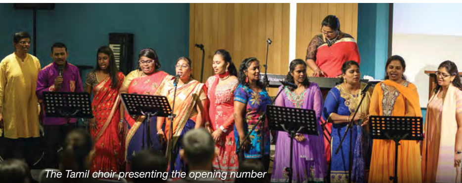
The Tamil choir presenting the opening number

Join the Tamil Ministry Fellowship on Sunday, 24 February 2019 at 11.30am at Theatrette 2, Calvary Convention Centre. For more information, call 03-8999 5532 ext 403.