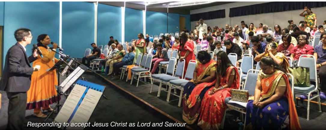
Responding to accept Jesus Christ as Lord and Saviour