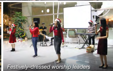
Festively-dressed worship leaders