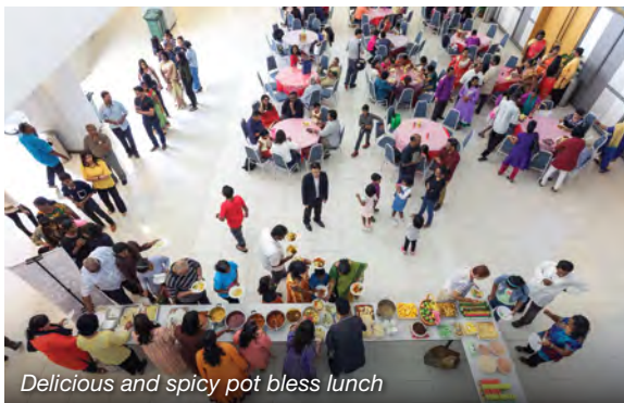
Delicious and spicy pot bless lunch