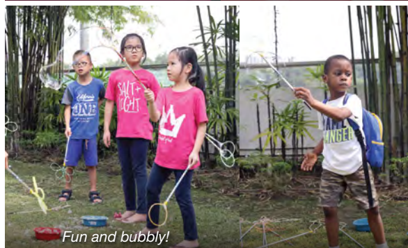
Fun and bubbly!