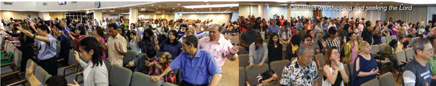
Calvarites worshipping and seeking the Lord

Let us welcome 2019, armed and blessed, with God's divine power and strength to rain down as we anticipate all the wondrous things God will continue to do in us and through us.