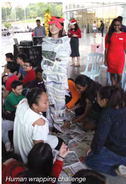
Human wrapping challenge

After that, we proceeded with gift exchange and recognizing the winners of the “Most Creatively Dressed” competition. The celebration concluded with the Christmas carol, “Feliz Navidad”. We thank God for answering our prayers for good weather and a successful celebration with 25 newcomers!