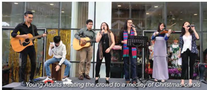
Young Adults treating the crowd to a medley of Christmas carols