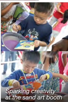
Sparking creativity at the sand art booth