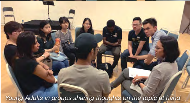
Young Adults in groups sharing thoughts on the topic at hand