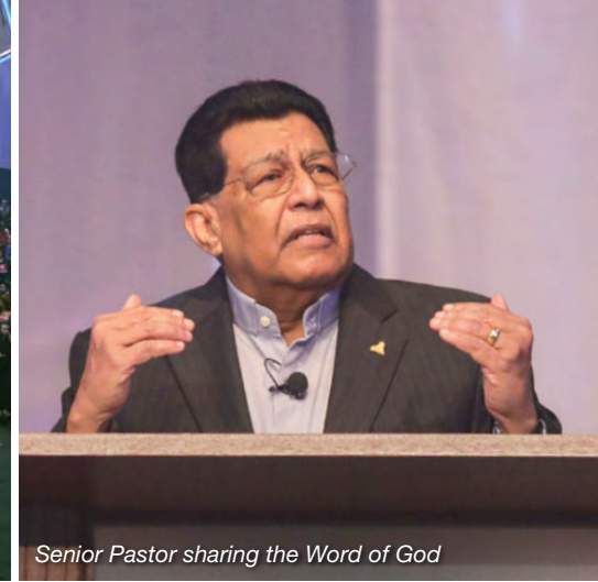
Senior Pastor sharing the Word of God