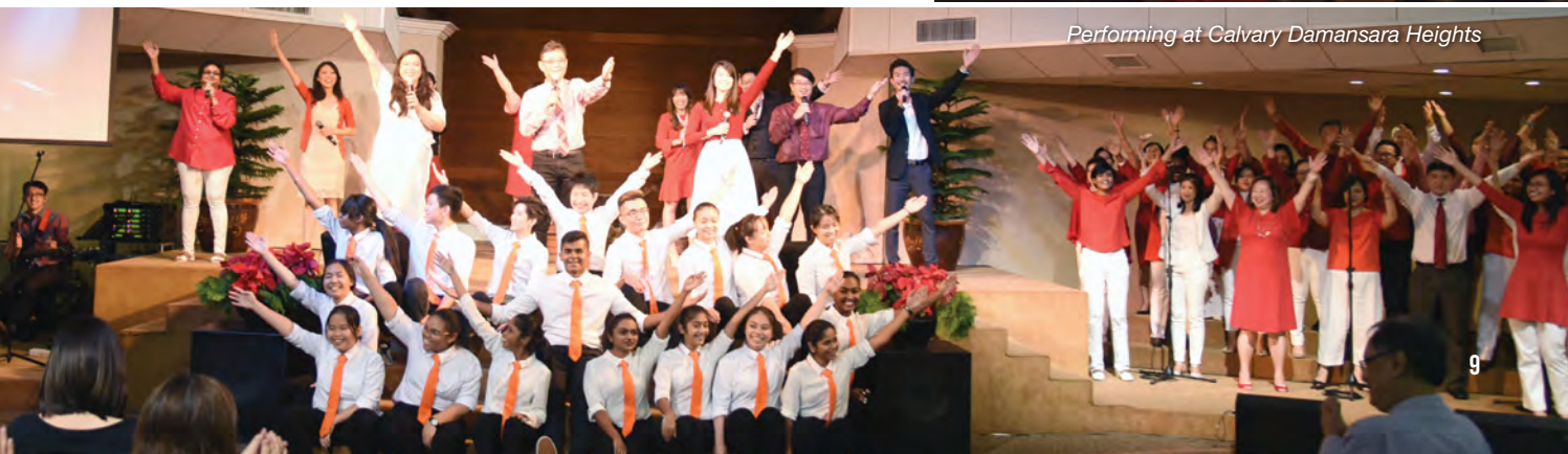
Performing at Calvary Damansara Heights