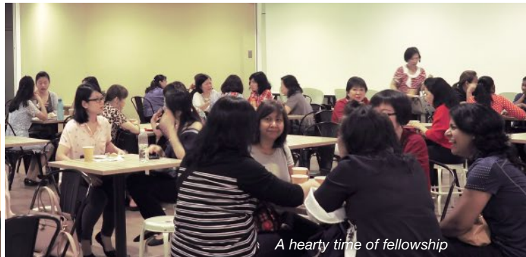
A hearty time of fellowship