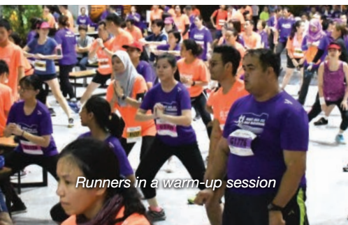
Runners in a warm-up session