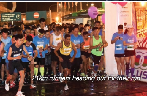
21km runners heading out for their run