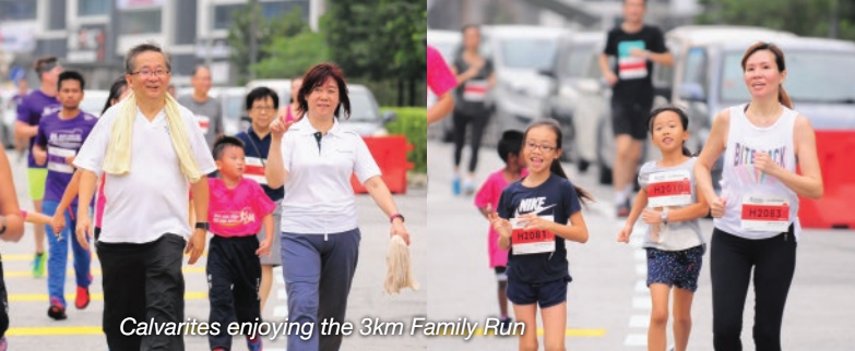
Calvarites enjoying the 3km Family Run