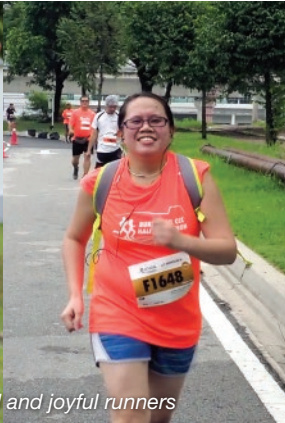
Excited and joyful runners

Truly, we praise God for a wonderful turnout of runners of which most were from the surrounding public community. The intention to bring the community together to encourage a healthy lifestyle and to demonstrate God's love was truly reflected with Calvarites taking up most of the serving duties such as assisting with race kit collection, being part of the water station crew, route marshals and handing out goodie bags and finisher medals.