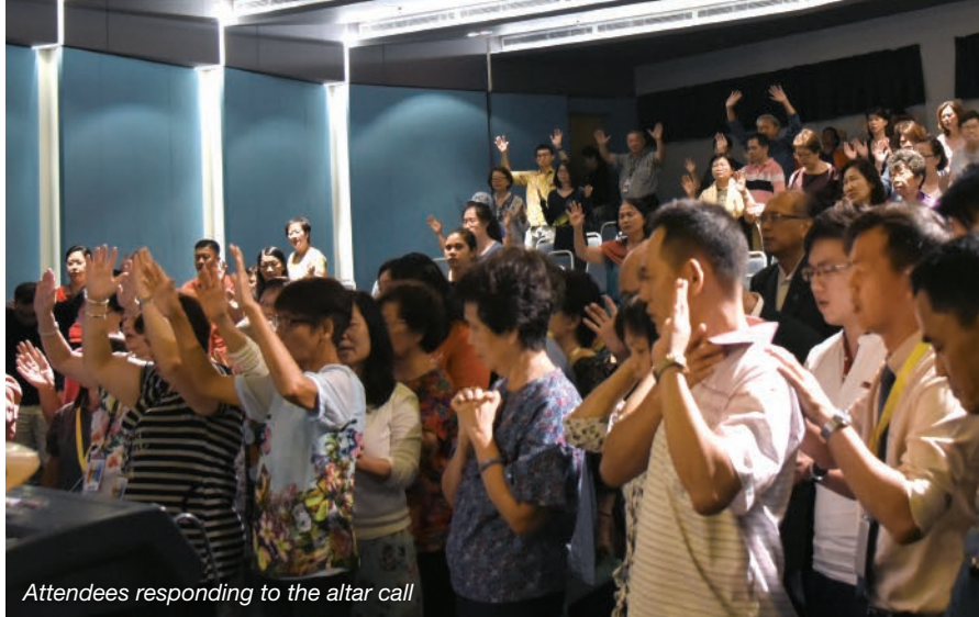
Attendees responding to the altar call