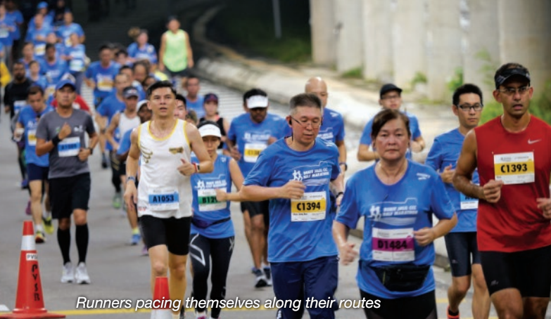
Runners pacing themselves along their routes