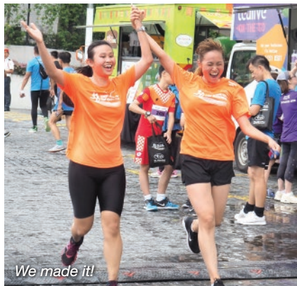
We made it!

Indeed, what a great testimony it is to have been able to organise an invigorating activity for the community!