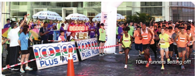
10km runners setting off