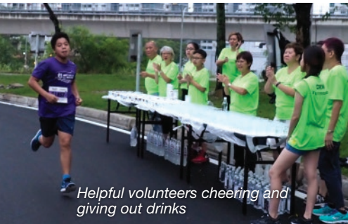
Helpful volunteers cheering and giving out drinks