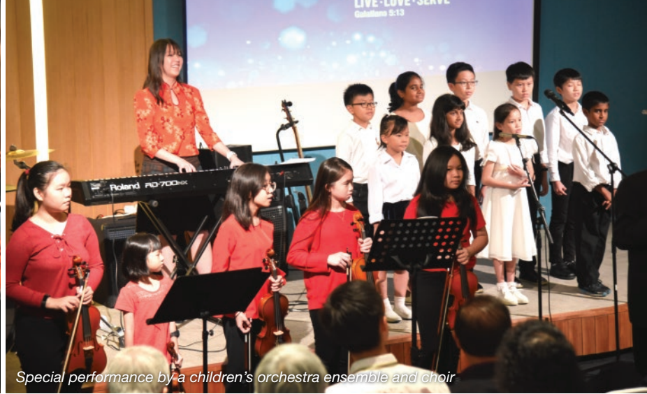
Special performance by a children's orchestra ensemble and choir

Meetings themed “You are Precious”. Both evenings began with a Chinese Gospel song performance by a children’s orchestra quartet and choir. It was enthralling to see some non-Chinese children singing a Chinese song for God’s glory.