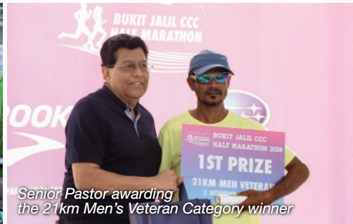
Senior Pastor awarding the 21km Men's Veteran Category winner