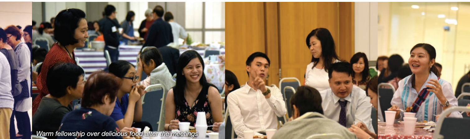
Warm fellowship over delicious food after the meetings

欢迎大家来参加我们在每个月的最后一个星期天，上午11时30分的中文团契。若知详情请联络 03 - 8999 5532。 Join the Chinese Fellowships on the last Sunday of each month, 11.30am at Calvary Convention Centre. For more information, call 03 - 8999 5532.