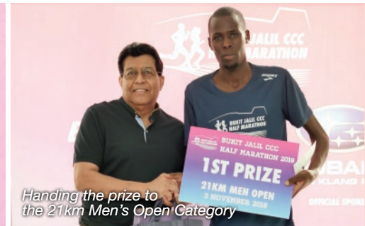
Handing the prize to the 21km Men's Open Category