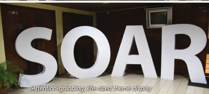
Attention-grabbing, life-sized theme display