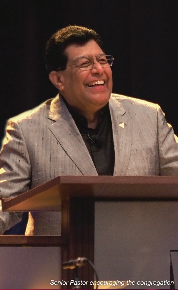
Senior Pastor encouraging the congregation