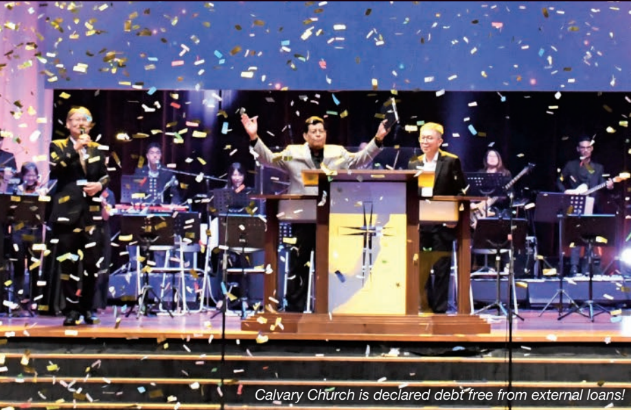
Calvary Church is declared debt free from external loans!