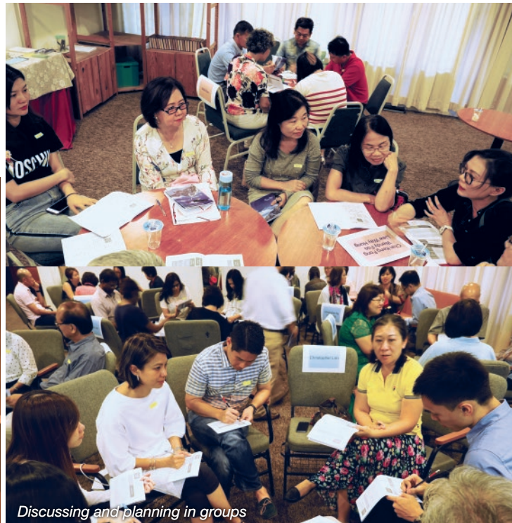
Discussing and planning in groups