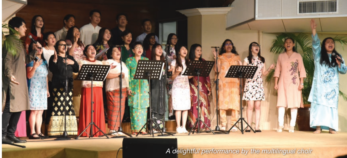
A delightful performance by the multilingual choir