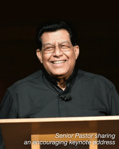
Senior Pastor sharing an encouraging keynote address