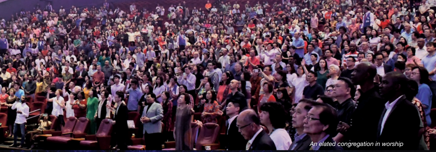
An elated congregation in worship