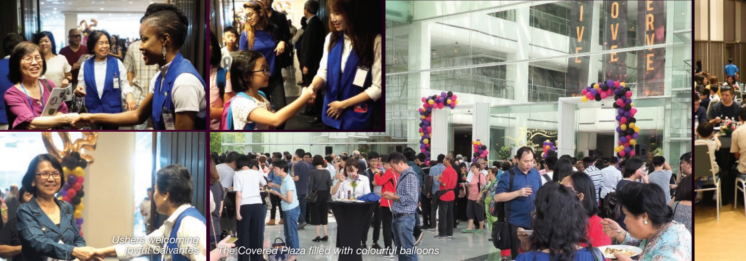
Ushers welcoming joyful Calvarites