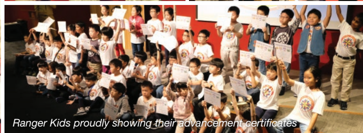
Ranger Kids proudly showing their advancement certificates