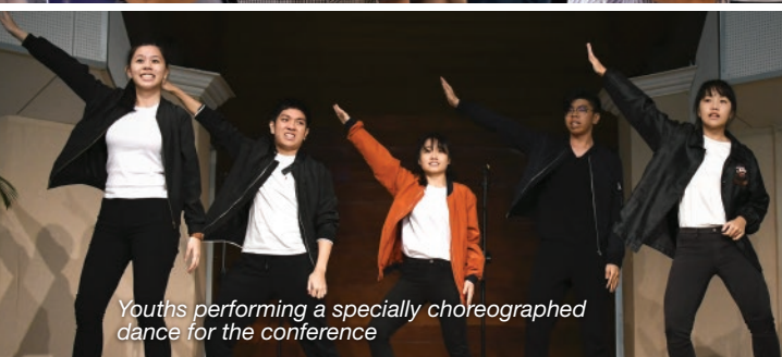
Youths performing a specially choreographed dance for the conference