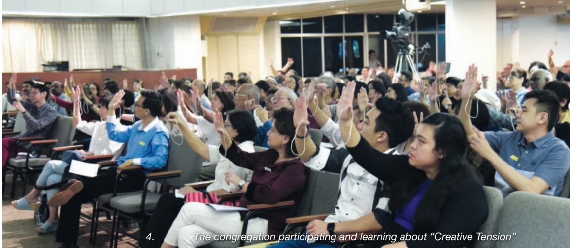
4. The congregation participating and learning about "Creative Tension"