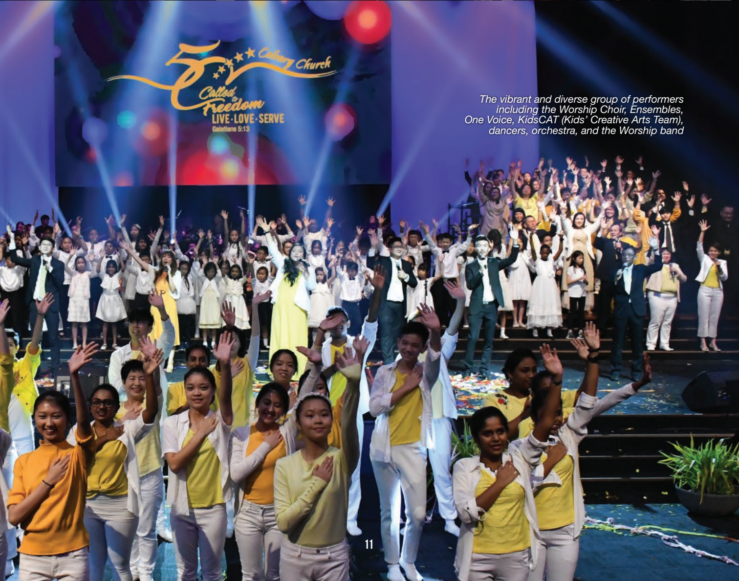
The vibrant and diverse group of performers including the Worship Choir, Ensembles, One Voice, KidsCAT (Kids' Creative Arts Team), dancers, orchestra, and the Worship band