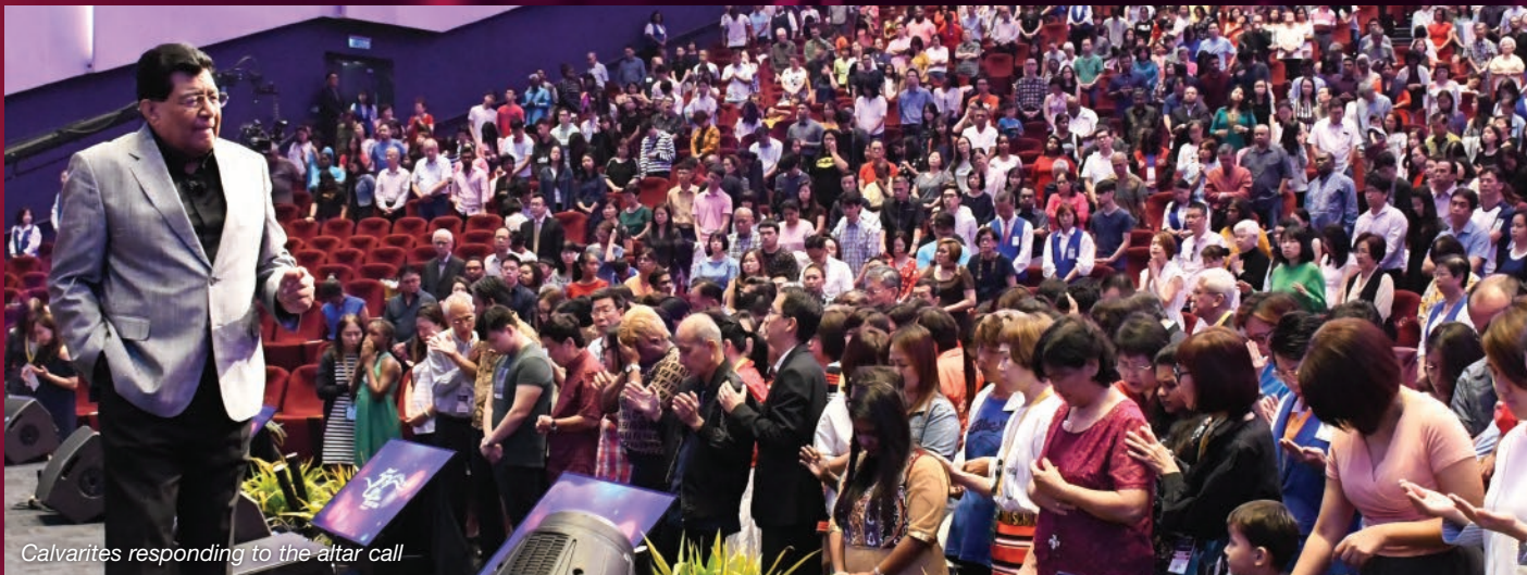
Calvarites responding to the altar call