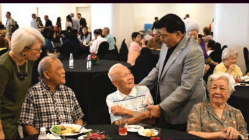
The Calvary family gathering in celebration with food and fellowship