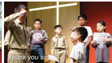
Thank you sir!