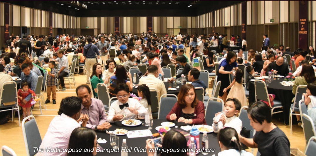
The Multipurpose and Banquet Hall filled with joyous atmosphere