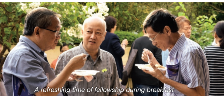
A refreshing time of fellowship during breakfast

The following morning, before the first plenary session, four Assistant LG Leaders were installed and prayed for. This is to meet the growing