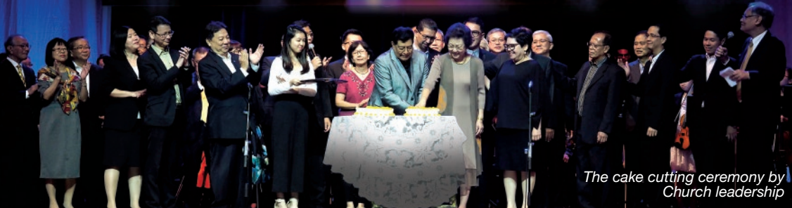
The cake cutting ceremony by Church leadership