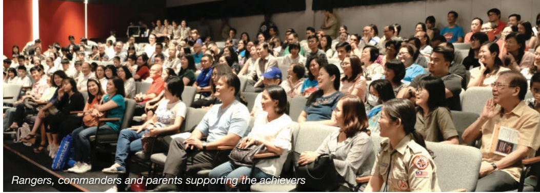
Rangers, commanders and parents supporting the achievers