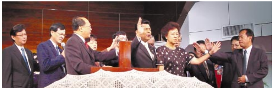
The Deacons, Associate Pastors and Assistant Pastors praying for the couple