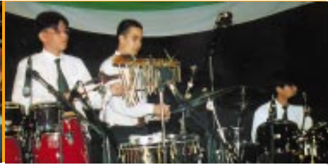
The orchestra and musicians...