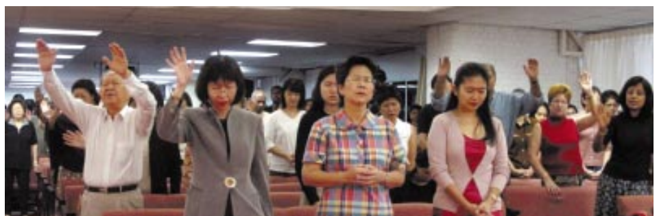
The congregation support in prayer