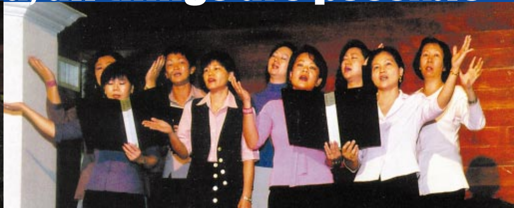
Ladies from Women in Business rendering a special song