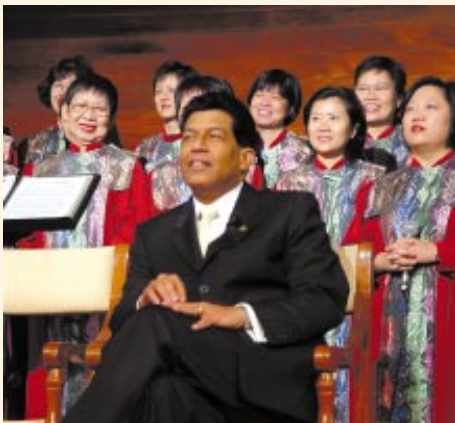
The Prince of her dreams provided by the Lord!