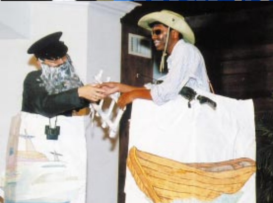
The Men's Ministries presenting a skit