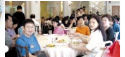
The food was great and opportunities abounded for fellowship around the tables