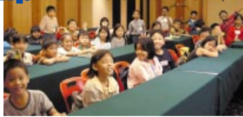
The 7-9 year old children