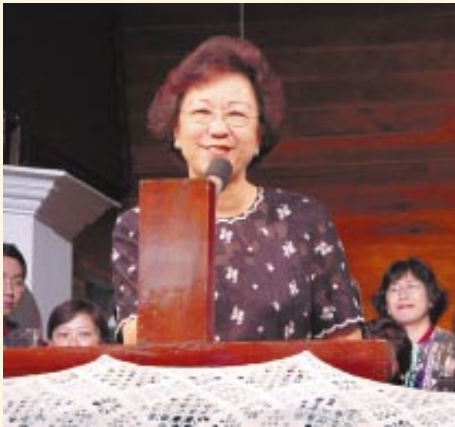
"Did I tell you about my dream as a girl to marry a prince?"