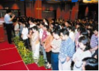
Asking Jesus to take control of our lives