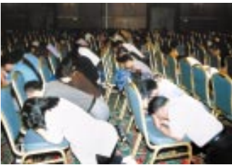
Everyone at their own personal altar

“After Penang bridge, go straight...take the corner where Kah Motor is—turn right—City Bayview Hotel is just next door. Congratulations!!! You are there!” With these excellent directions plus a map of an alternative route, the 551 campers had no difficulty locating our “camp site”. There was an air of anticipation of what the Lord would do as we had been encouraged to set our personal goals prior to our arrival in Penang. There was also an eagerness to try out the famed culinary delights for which this northern state is famous!