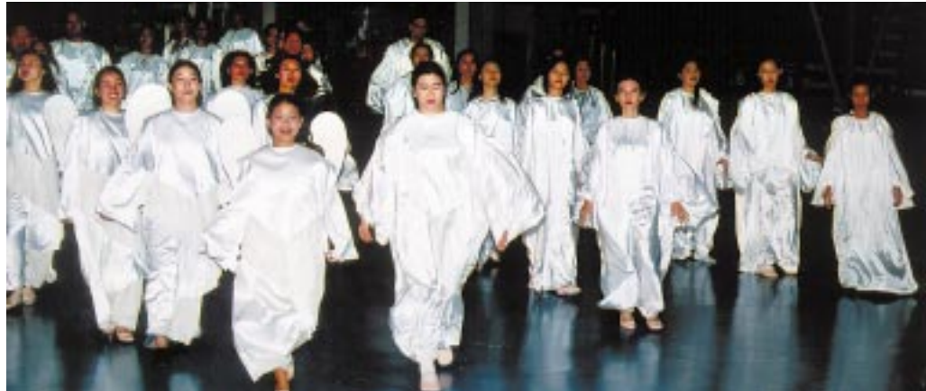
...together with the worship leaders, the choir and praise team worshipping our Saviour and Lord Jesus Christ!