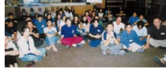
The youth learning from the video with Dr James Dobson

“After Penang bridge, go straight...take the corner where Kah Motor is—turn right—City Bayview Hotel is just next door. Congratulations!!! You are there!” With these excellent directions plus a map of an alternative route, the 551 campers had no difficulty locating our “camp site”. There was an air of anticipation of what the Lord would do as we had been encouraged to set our personal goals prior to our arrival in Penang. There was also an eagerness to try out the famed culinary delights for which this northern state is famous!