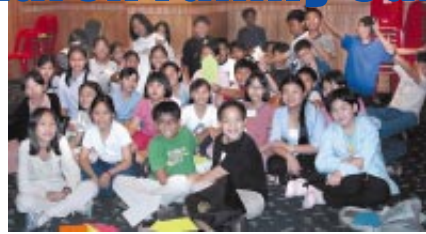
The 10-13 year olds