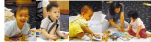
The toddlers had their own programme!