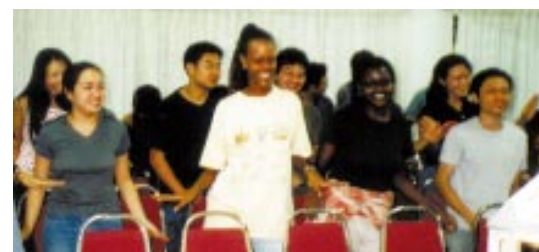
"Red and yellow, black and white, all are precious in His sight..."