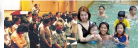
Those in leadership being challenged to raise up others to service and leadership