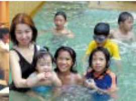
Kids and a mum having fun in the pool