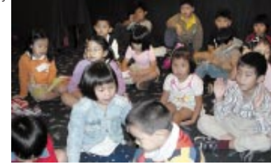
The 4-6 year old children learning to pray