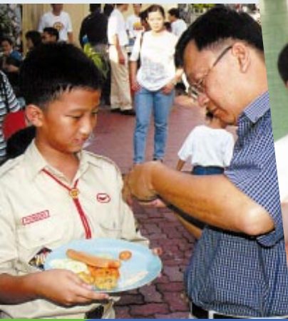
Fathers and sons trying to display the food in the most creative way possible!