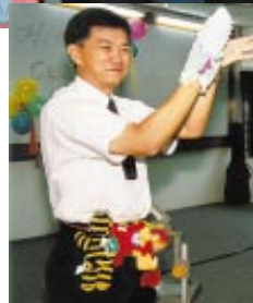
▲ A parent doing a skit at Cheras