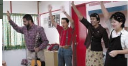
▼ Parents greeting the kids at Damansara Heights