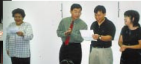
▲ Parents singing a song at Ampang