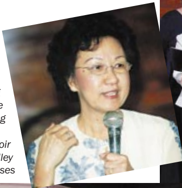
The Chinese Choir presented a medley of three choruses