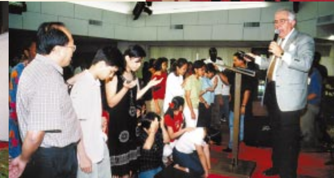
Young people responding to the Lord at the altar