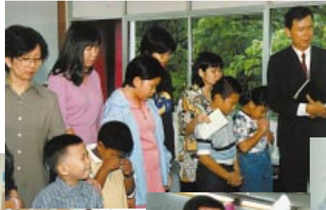
▲ Parents and teachers praying for the kids at Cheras