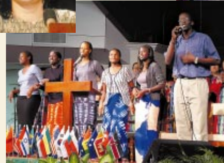
The African students teaching the song "Wonder Why"