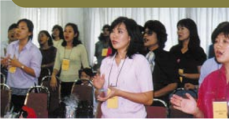
At Elim bungalow