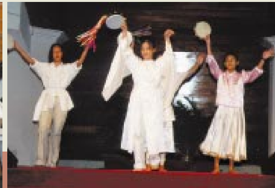
▲ The Friends Club doing a tambourine dance