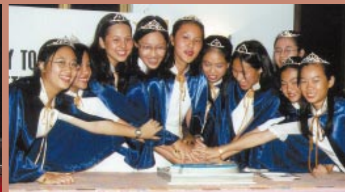
▲ Celebrating at Dynasty Hotel!