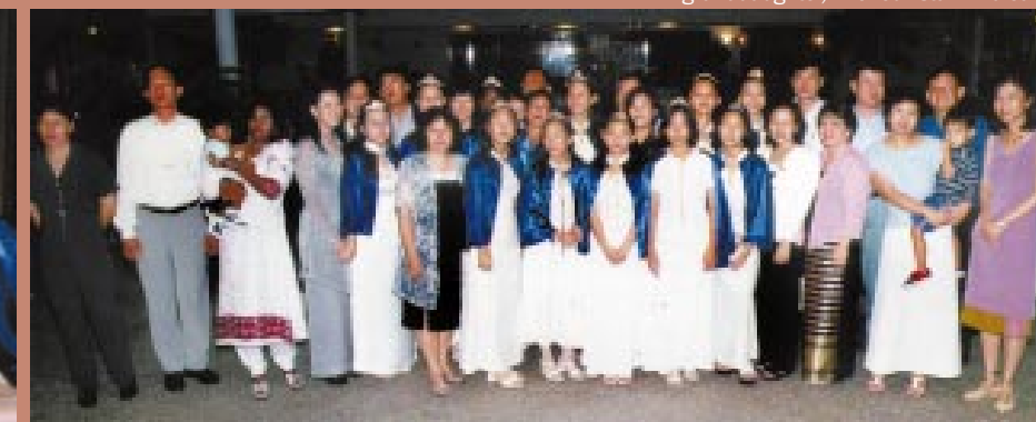
▲ The "Honour Stars" with their proud parents and family members