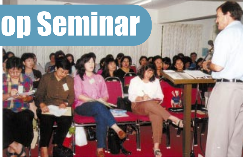
Participants eager to learn all they can

art of quick-board sketching done with extra large poster chalks.