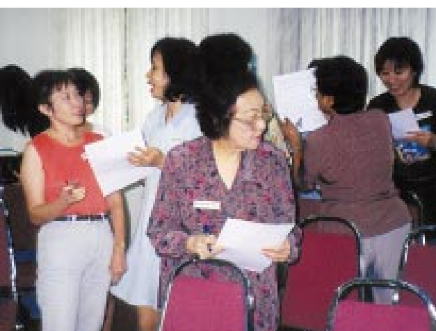
Playing the “ice-breaker”[

Fellowship and building relationships were also among the objectives that day. Before breaking for some refreshment, the LG leaders had some good laughs when they played the “ice-breaker”. Three LG leaders were given gifts for being the first three to complete the game. 🎁