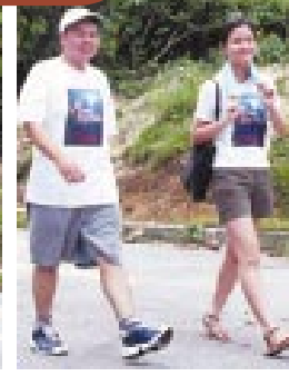
Some walked and talked