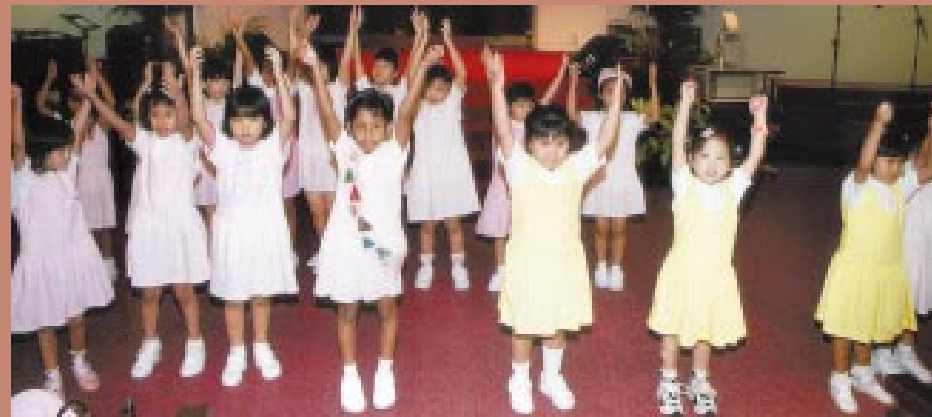
◆ The Rainbows, Daisies and Prims presenting a song and skit