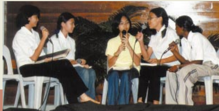
▲ The Girls Only Club presenting their hilarious skit