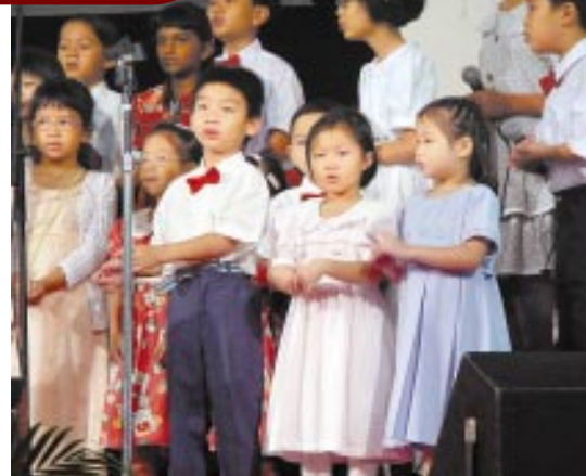
The Carpenter's Workshop children formed various choirs to sing a special song in honour of mothers at Calvary Church Damansara Heights as well as at the Satellite Churches