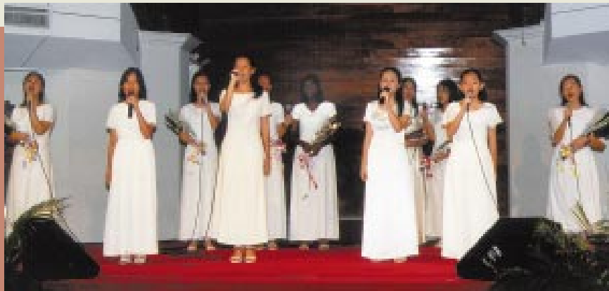
◆ The "Honour Stars" displaying their varied talents—singing and playing the violin