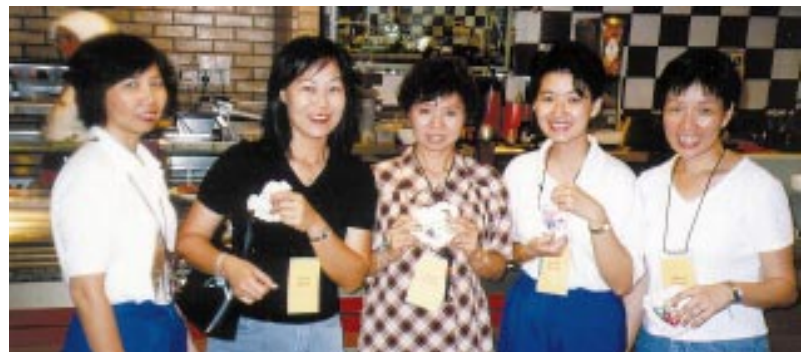
The first team to submit their treasures and answers

The event left the mothers grateful for the opportunity to know each other in the short and fun-filled time spent together. Praise God for mothers who can do anything in Christ Jesus! 🙌