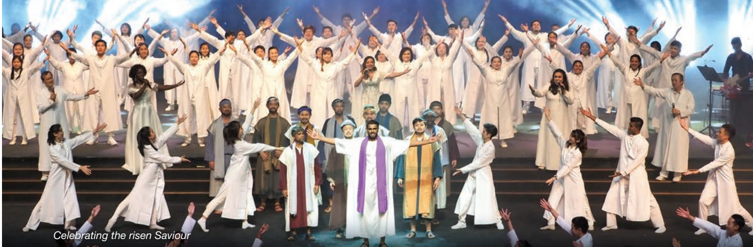
Celebrating the risen Saviour