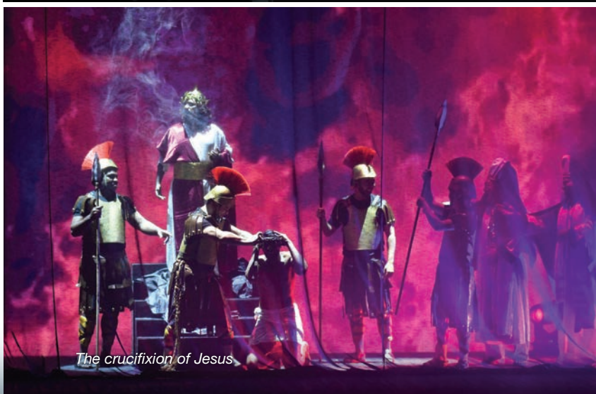
The crucifixion of Jesus