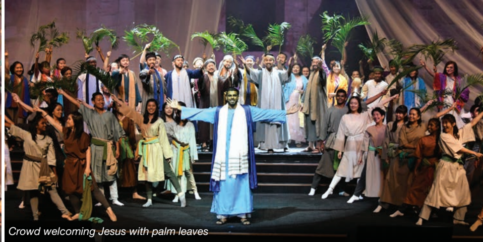
Crowd welcoming Jesus with palm leaves