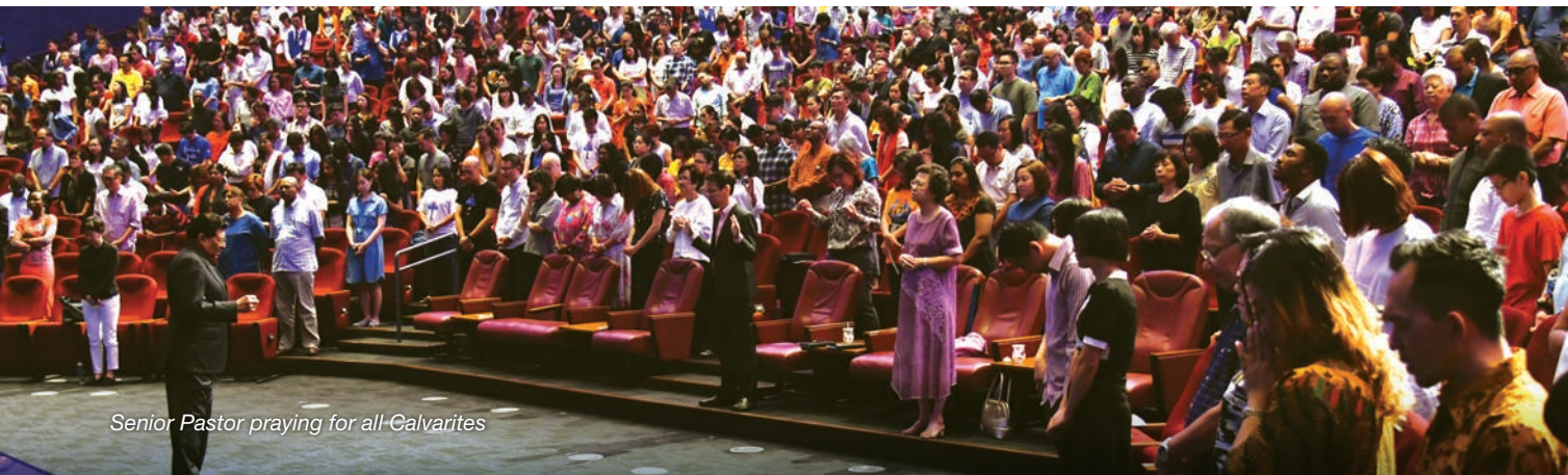
Senior Pastor praying for all Calvarites