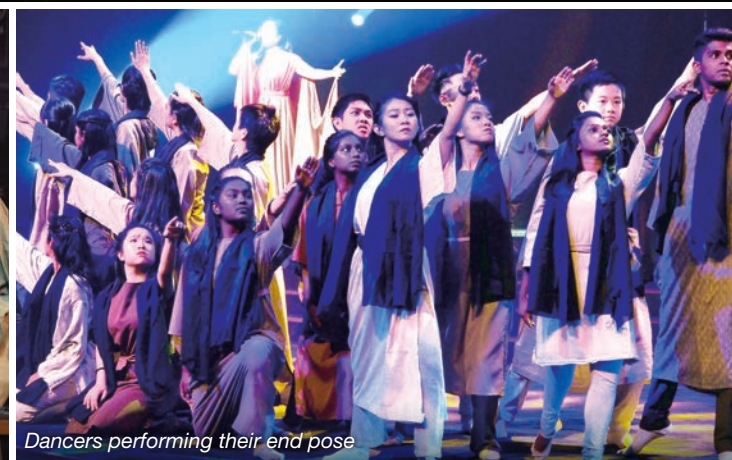
Dancers performing their end pose