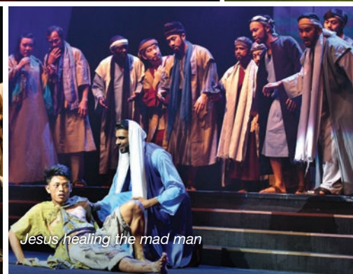
Jesus healing the mad man