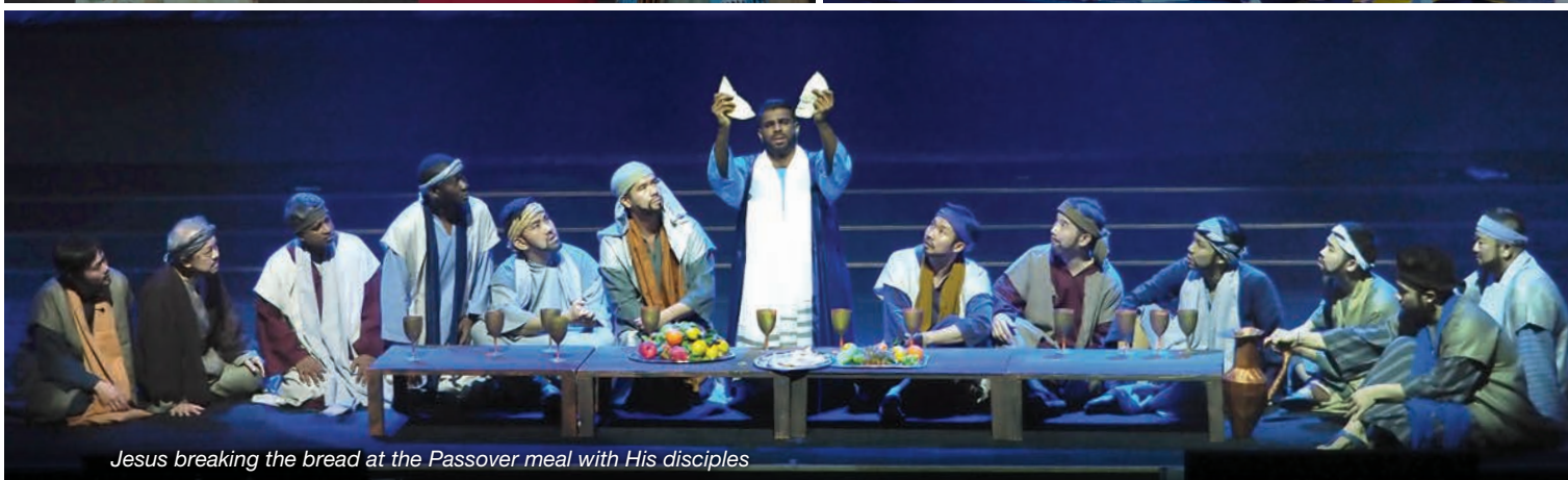
Jesus breaking the bread at the Passover meal with His disciples