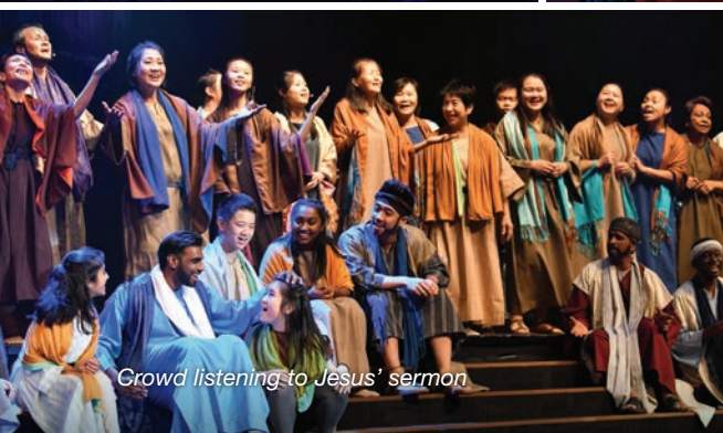
Crowd listening to Jesus' sermon