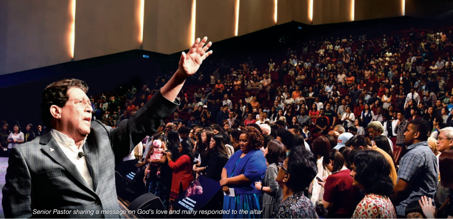
Senior Pastor sharing a message on God's love and many responded to the altar