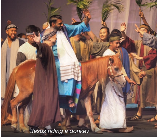
Jesus riding a donkey