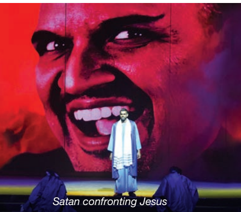
Satan confronting Jesus

View more photos at our Facebook page @calvarykl