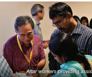
Altar workers providing assistance and prayer for the respondents.