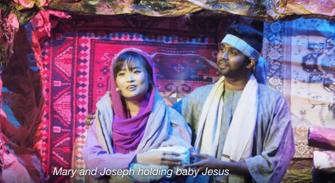
Mary and Joseph holding baby Jesus