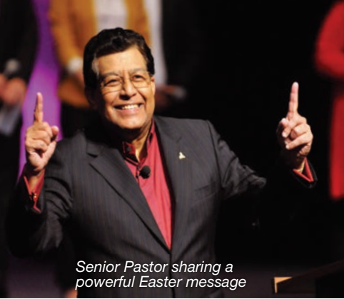
Senior Pastor sharing a powerful Easter message