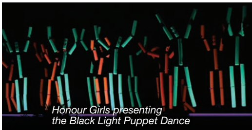
Honour Girls presenting the Black Light Puppet Dance