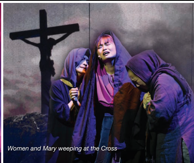
Women and Mary weeping at the Cross