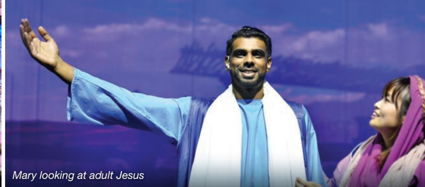
Mary looking at adult Jesus