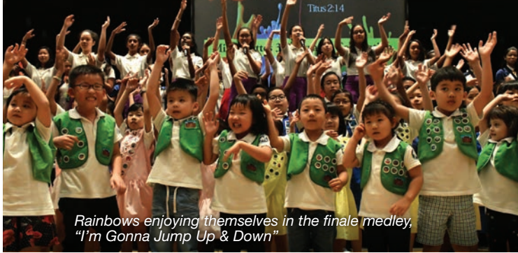
Rainbows enjoying themselves in the finale medley, "I'm Gonna Jump Up & Down"