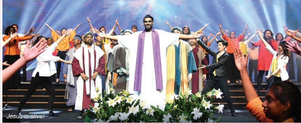
Jesus is alive!