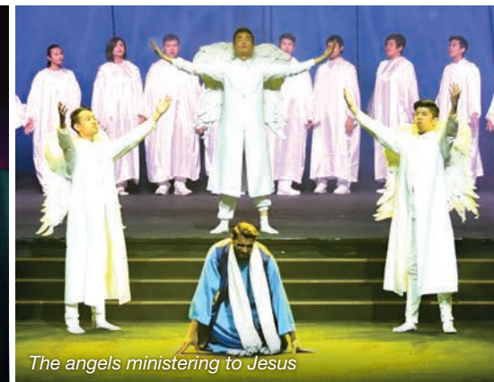
The angels ministering to Jesus