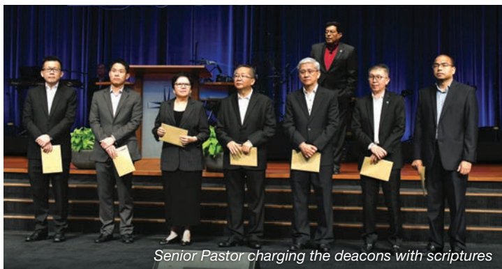
Senior Pastor charging the deacons with scriptures