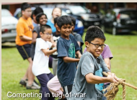
Competing in tug-of-war