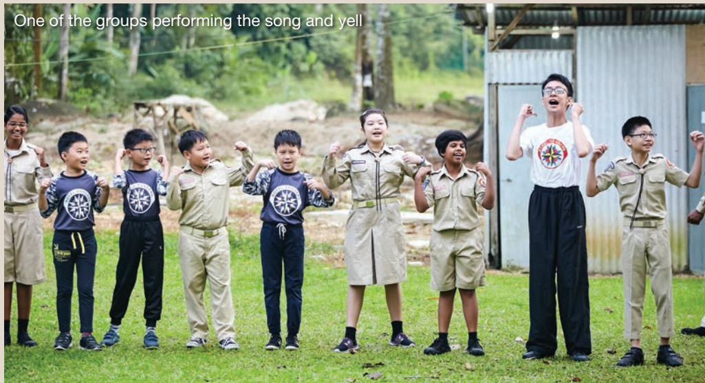
One of the groups performing the song and yell