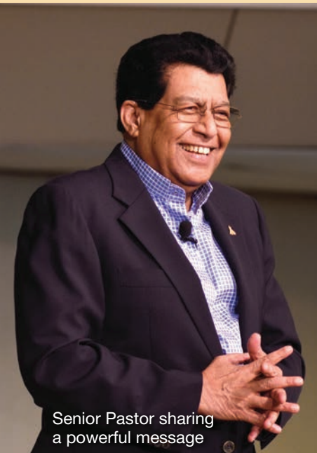
Senior Pastor sharing a powerful message