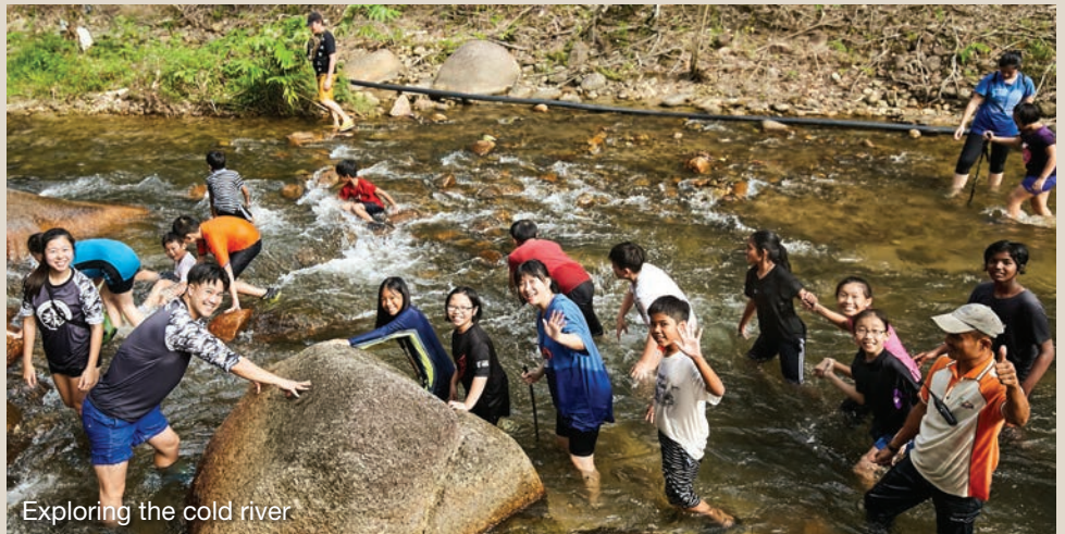
Exploring the cold river

There were smiles, joys and memorable moments as we left the camp. To God be the glory!