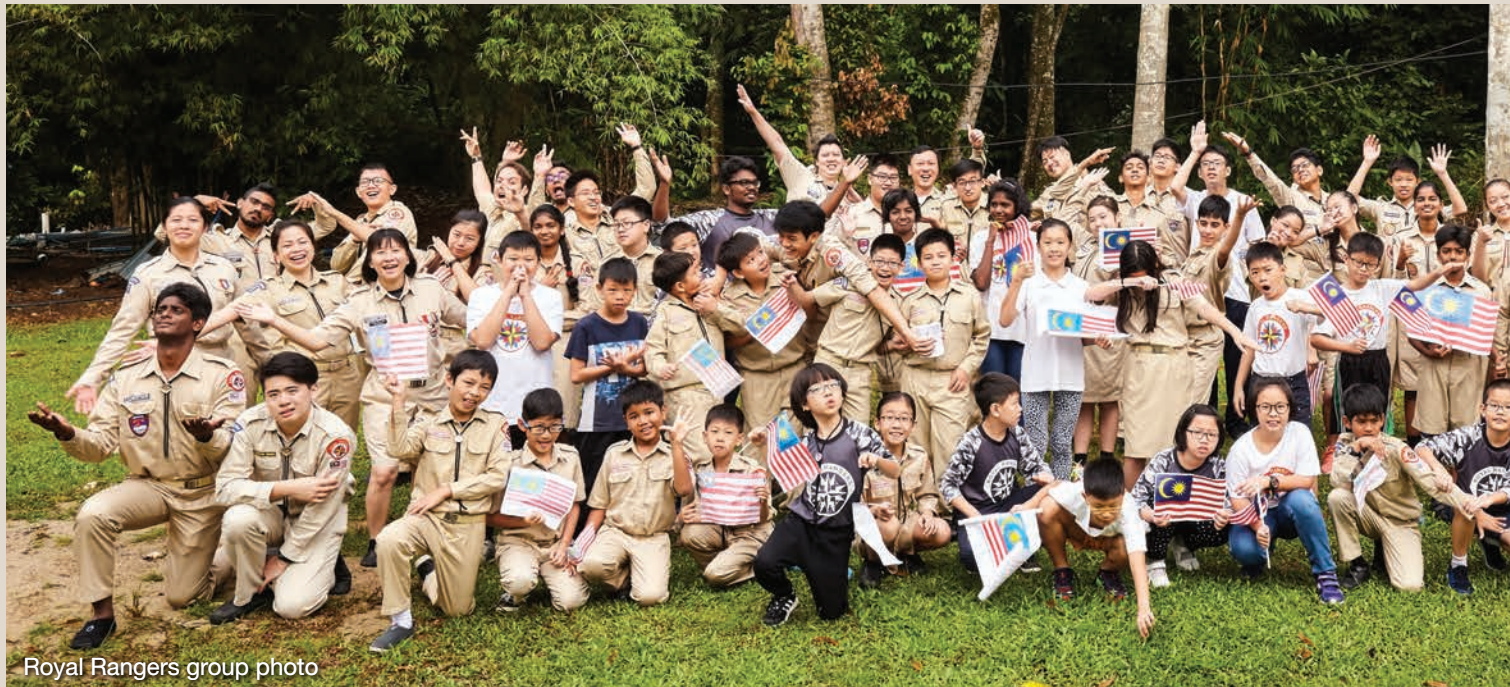
Royal Rangers group photo

From Thursday to Saturday, 31 August – 2 September 2017, a total of 93 Royal Rangers and Commanders participated in their Annual Camp at the Pasir Puteh Resort, Kalumpang.