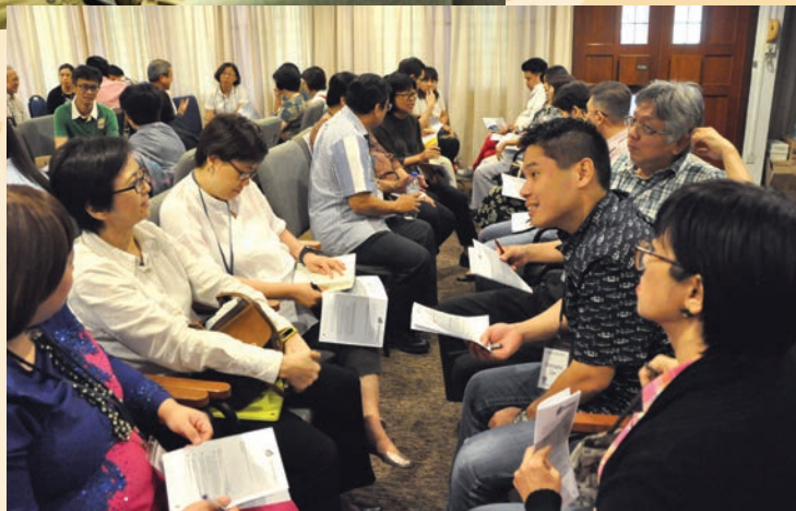
Participants discussing the questions and sharing with one another