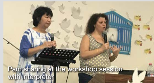
Pam sharing at the workshop session with interpreter

She gave a seed offering on behalf of the Women's Ministry of Calvary Church and collected an offering from the women for this new work. The women were very enthusiastic; they not only gave but immediately offered themselves as volunteers for the home.