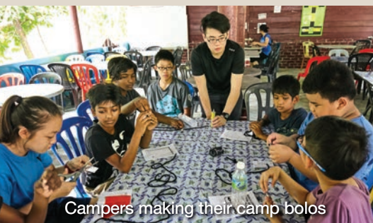
Campers making their camp bolos