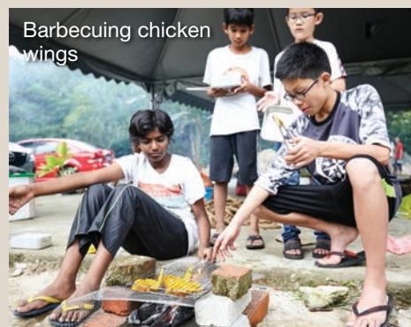
Barbecuing chicken wings