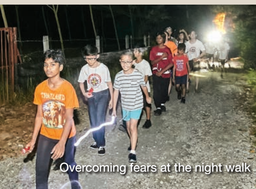
Overcoming fears at the night walk