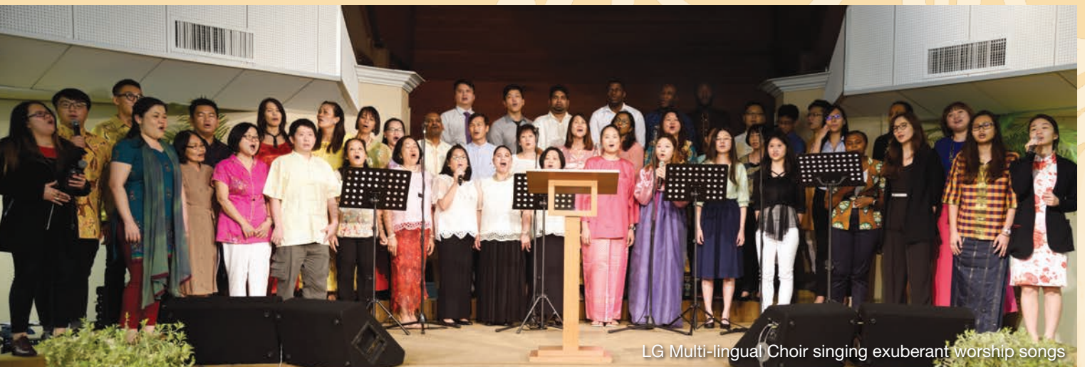
LG Multi-lingual Choir singing exuberant worship songs