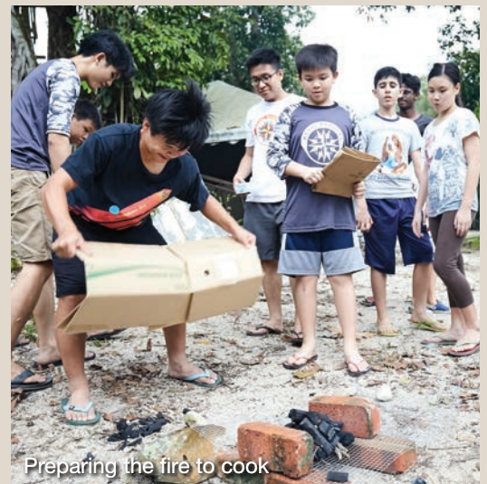
Preparing the fire to cook