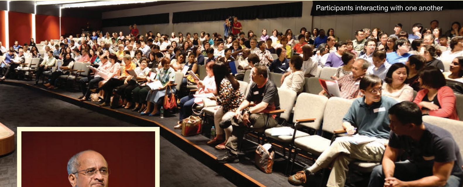
Participants interacting with one another