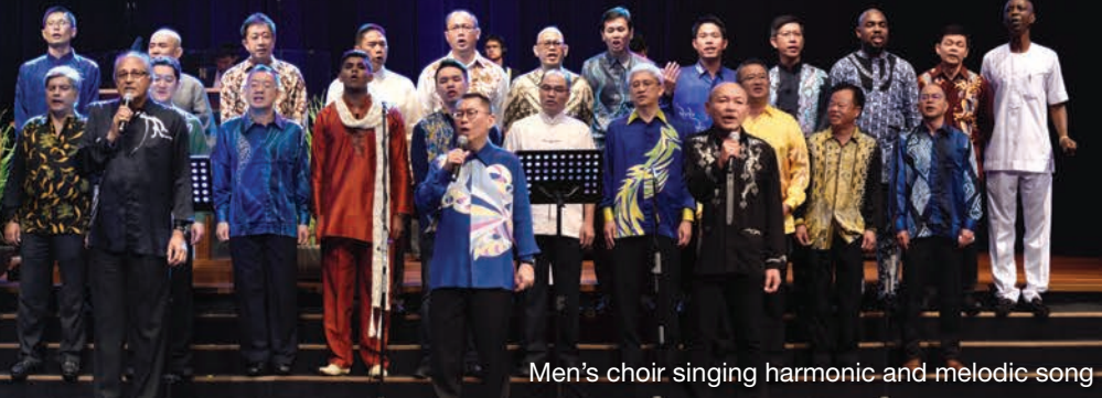
Men's choir singing harmonic and melodic song