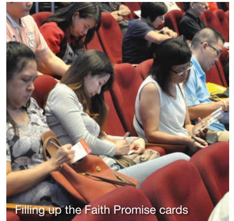
Filling up the Faith Promise cards

The weekend marked the beginning of renewed hearts for missions work both locally and globally for the Lord.