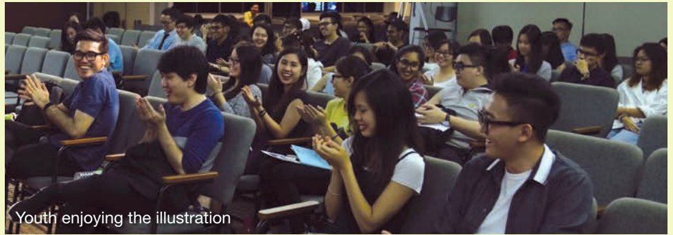
Youth enjoying the illustration

Excuses, excuses, excuses! Time and time again we find ourselves resorting to excuse when responsibilities seems overwhelming, the task at hand becomes challenging or when our commitment requires more sacrifice than we expected.