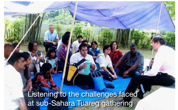
Listening to the challenges faced at sub-Saharan Tuareg gathering