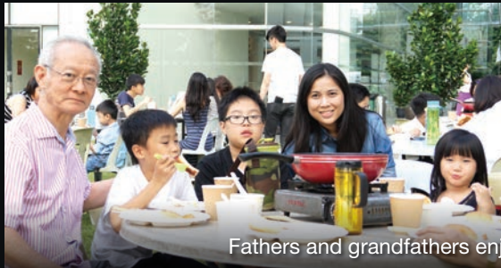
Fathers and grandfathers enjoying breakfast with their families