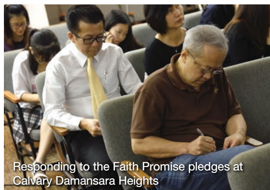
Responding to the Faith Promise pledges at Calvary Damansara Heights