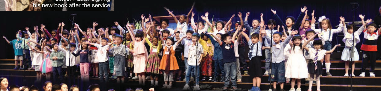
Children ages 5-6 years presenting exciting song with actions