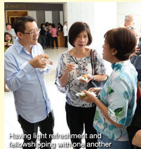
Having light refreshment and fellowship with one another