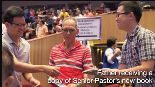
Father receiving a copy of Senior Pastor's new book