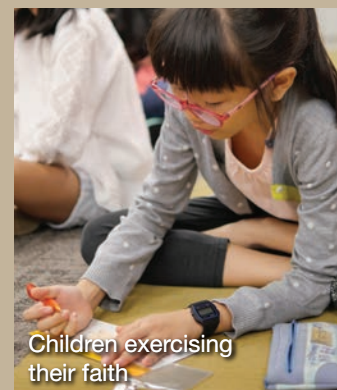
Children exercising their faith