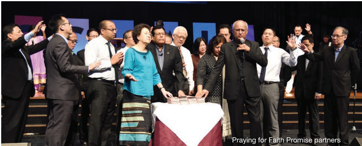
Praying for Faith Promise partners

“Is there anything about our lives that should convince anyone around us to turn to Jesus?”