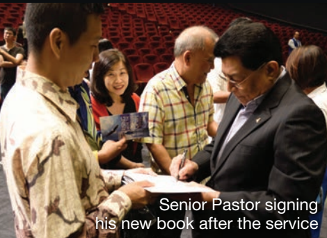
Senior Pastor signing his new book after the service

We truly praise and thank God for fathers for their sacrificial love in building and strengthening their families. In the times we are living, may our Heavenly Father continue to strengthen and empower every father to be His mouthpiece. Godly fathers make strong families, and strong families make a nation strong.