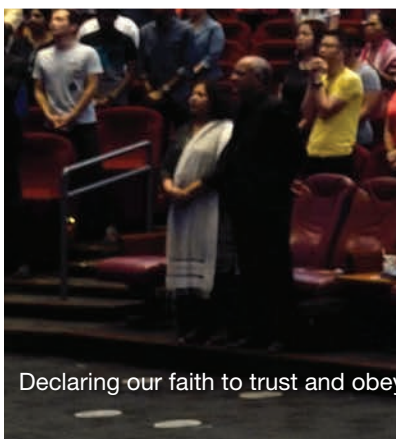
Declaring our faith to trust and obey the Lord