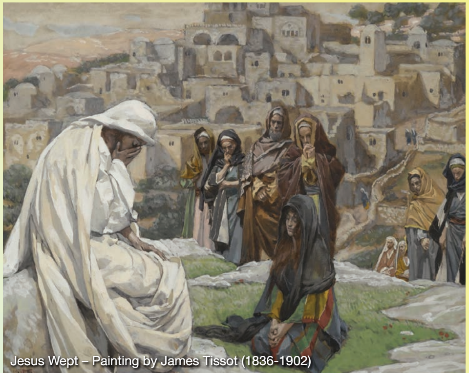
Jesus Wept – Painting by James Tissot (1836-1902)

The Bible says, “Therefore, when Jesus saw her weeping, and the Jews who came with her weeping, He groaned in the spirit and was troubled. And He said, “Where have you laid him?” They said to Him, ‘Lord, come and see.’ Jesus wept” (John 11:33-35). Months ago, Jesus had spent a good deal of time in Lazarus’ house in Bethany with his family, particularly his two sisters, Mary