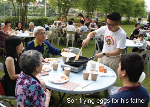
Son frying eggs for his father