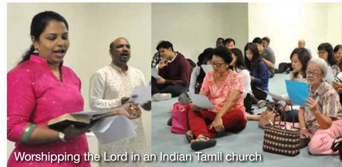
Worshipping the Lord in an Indian Tamil church