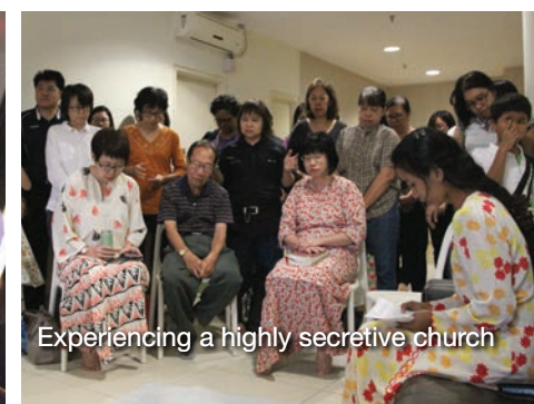
Experiencing a highly secretive church