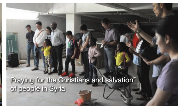
Praying for the Christians and salvation of people in Syria