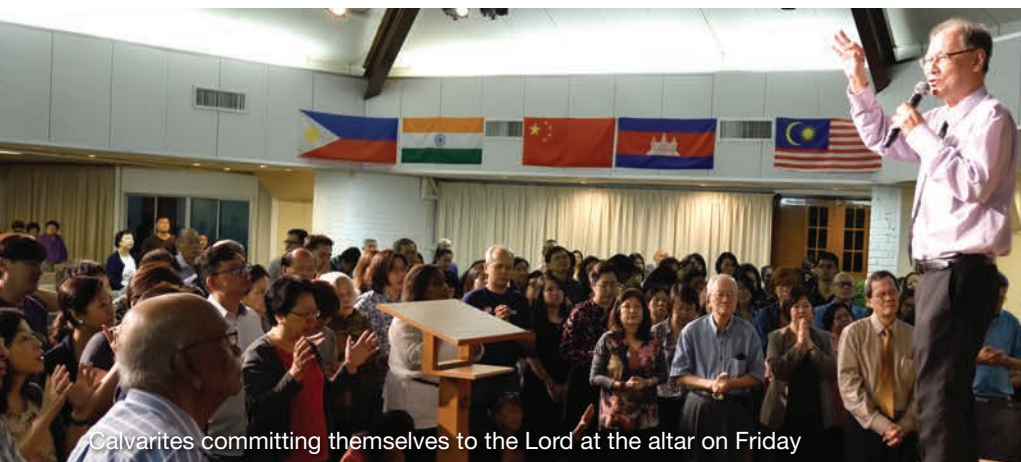
Calvarites committing themselves to the Lord at the altar on Friday