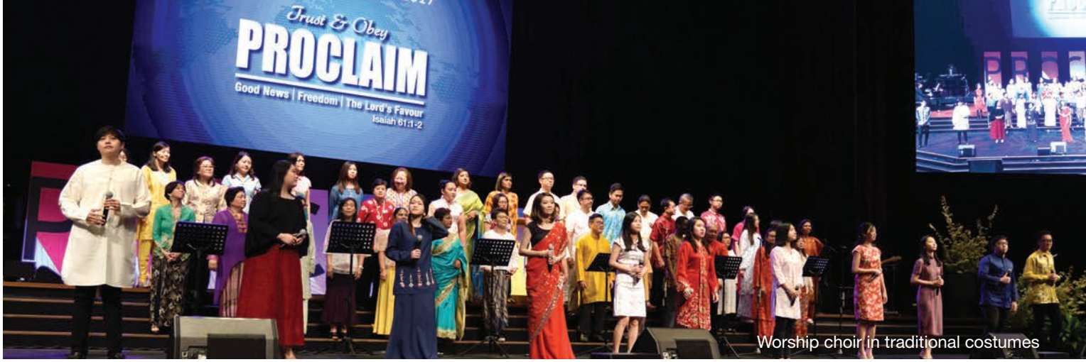
Worship choir in traditional costumes