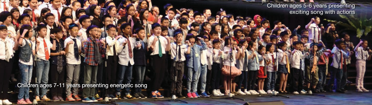
Children ages 7-11 years presenting energetic song