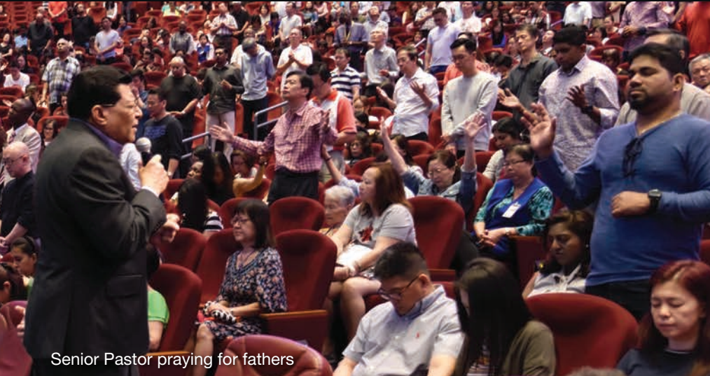
Senior Pastor praying for fathers

God entrusted families to fathers. Fathers are the head of the family, and they are to care for their families and bring up their children in the ways of the Lord. Calvary Church took opportunity to honour all fathers present on Father's Day, on Sunday, 18 June 2017 at Calvary Convention Centre.