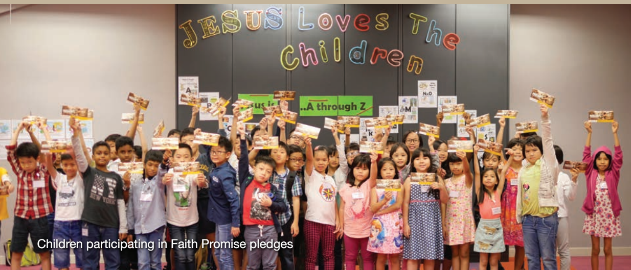
Children participating in Faith Promise pledges

half of the year 2017 Faith Promise were awarded as an encouragement to be faithful in doing God's work. Praise God, with a renewed faith, we saw an increase of number of children participated for the July to December 2017 Faith Promise commitment.