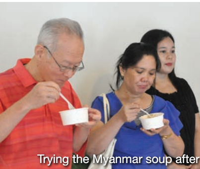
Trying the Myanmar soup after fellowship