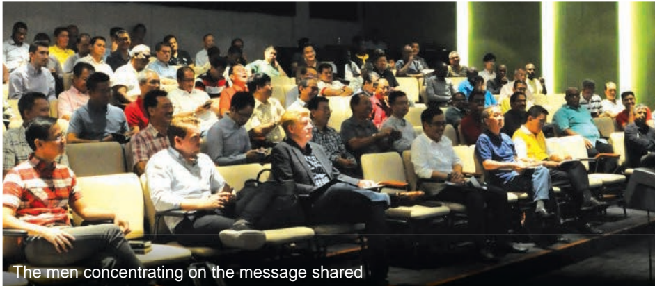
The men concentrating on the message shared