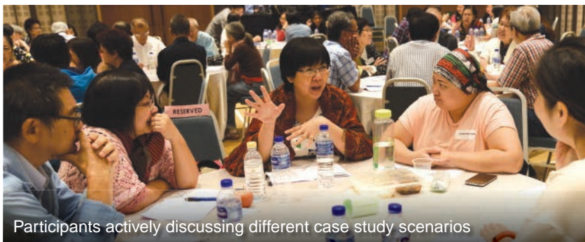
Participants actively discussing different case study scenarios