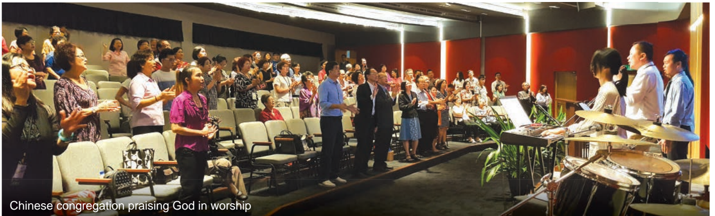
Chinese congregation praising God in worship