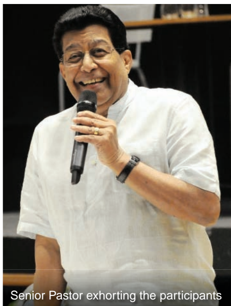
Senior Pastor exhorting the participants