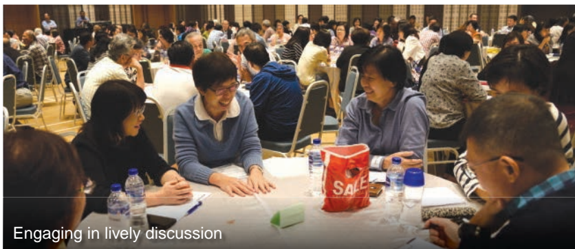
Engaging in lively discussion