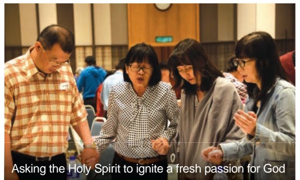
Asking the Holy Spirit to ignite a fresh passion for God