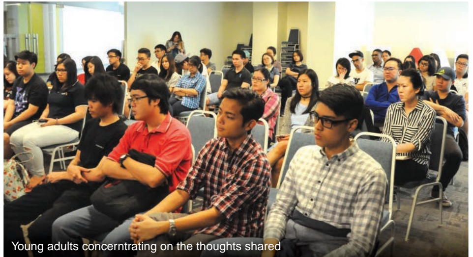
Young adults concentrating on the thoughts shared

A sample resume was discussed with the young adults, and the do's and don'ts in a resume were shared. Key pointers provided were