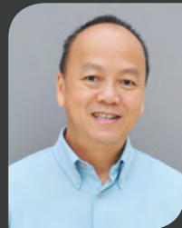
20 Years Phang Wai Missions Ministry Staff