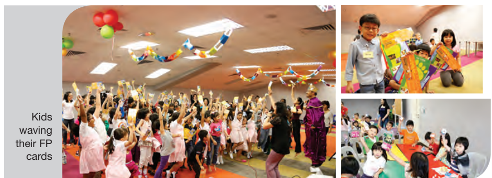
Kids waving their FP cards

Praise and thank God for granting us the faith in renewing our missions pledge and new passion to reach out in missions. Senior Pastor prayed for all Faith Promise partners that God will bless us all and bring us to a higher level of faith, maturity and experience His miraculous provisions.