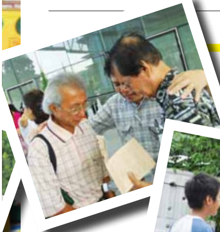
Praying in small groups before going out