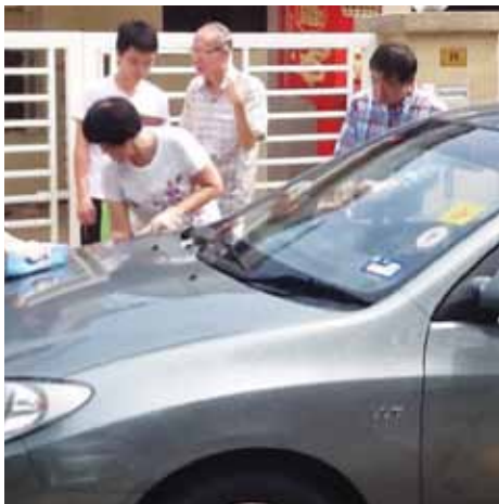
Car Washing Engaging the community by washing their cars