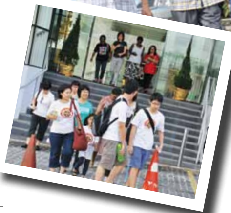
Calvarites going out in teams

C alvarites of all ages, first-timers and veterans gathered in unity at the Plaza at Calvary Convention Centre (CCC) on 30 November 2013 for Operation Saturation 3.