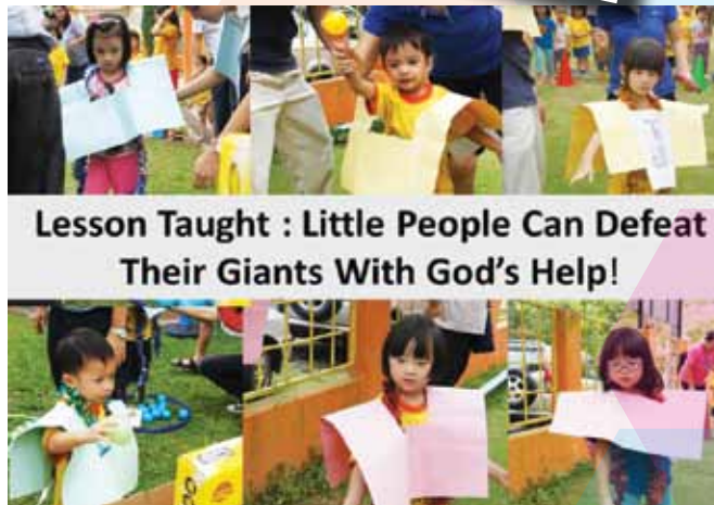
Lesson Taught : Little People Can Defeat Their Giants With God's Help!