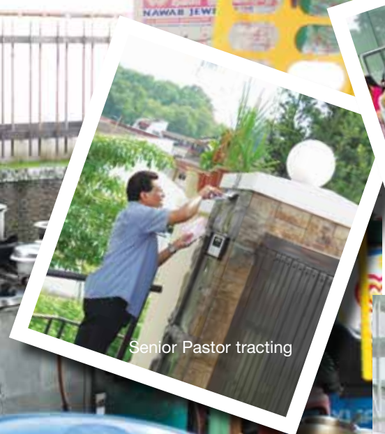
Senior Pastor tracting