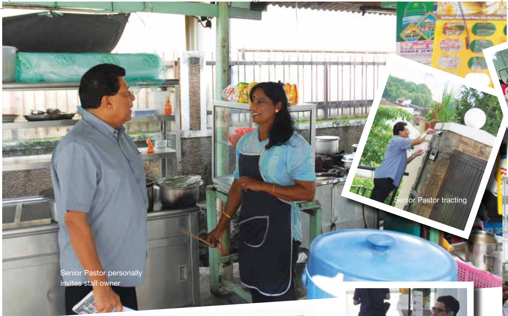
Senior Pastor personally invites stall owner