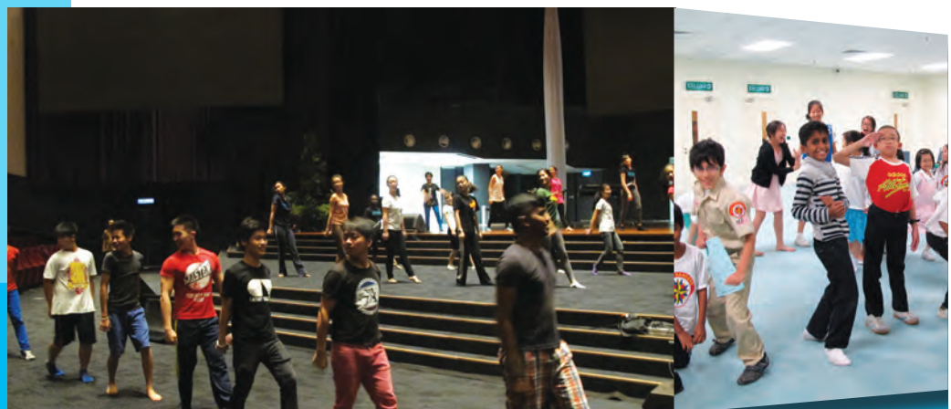
Top row, left to right: Sopranos & altos rehearsing at CCC; Combined choir rehearsing at DH; Bass section rehearsing; Trainer giving direction; Production Coordinator sounding the right note Bottom row, left to right: Combined dance rehearsals at CCC stage; Kids choir posing for a group pic; Kids auditioning for drama roles; Wardrobe assistants putting together an outfit for a wiseman & sorting out the costumes

Senior Pastor will be sharing on the Good News of this hope in Jesus. This is a wonderful opportunity for your loved ones, friends and neighbours to know and believe in Jesus! +