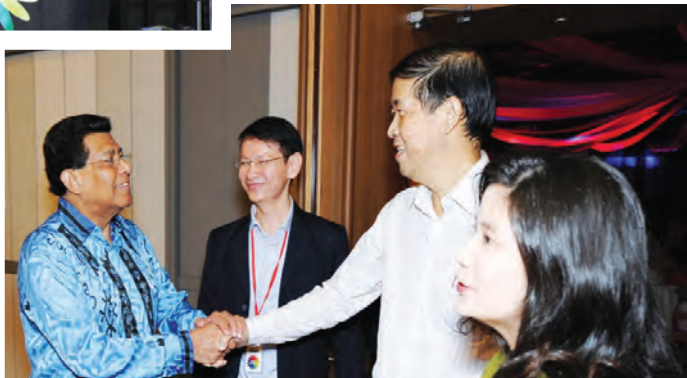
Main pic: Guests at beautifully decorated CCC Multipurpose Banquet Hall