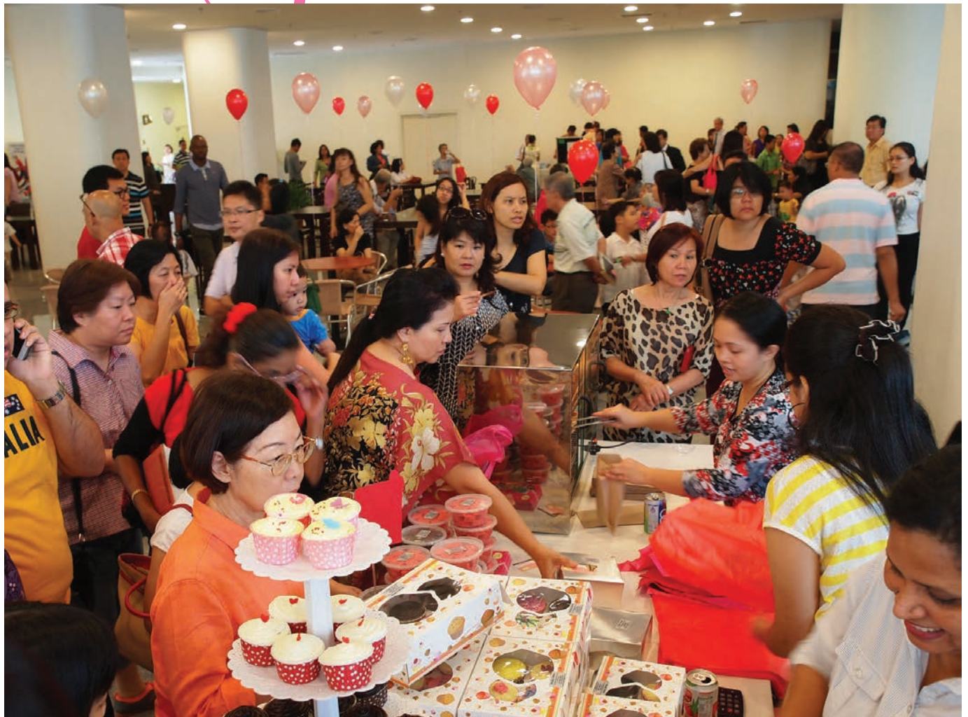
Brisk turnover at cakes stall