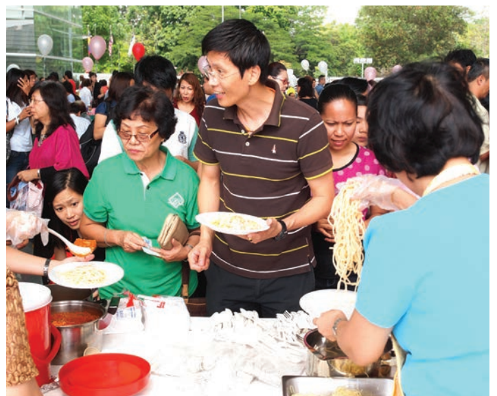
Clockwise from top left: Queing for food; Enjoying a meal at the Plaza; Coffee is served; Flowers at Missionettes stall a hot favourite; Church staff serving spaghetti