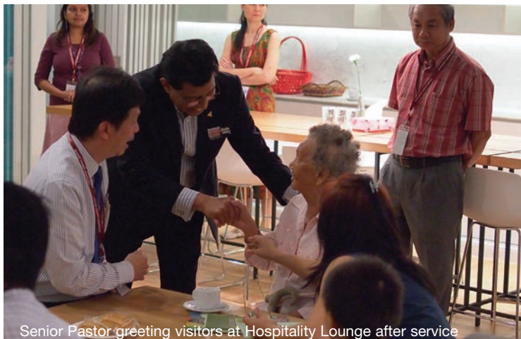
Senior Pastor greeting visitors at Hospitality Lounge after service

Receiving Jesus' Priceless Legacy Of Peace!