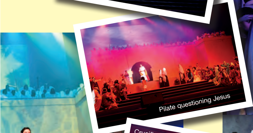
Pilate questioning Jesus