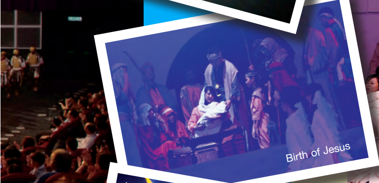
Birth of Jesus