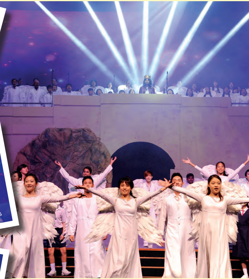
Glorious resurrection of Jesus depicted through song and dance