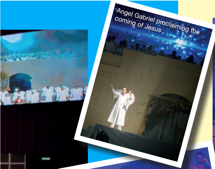
Angel Gabriel proclaiming the coming of Jesus