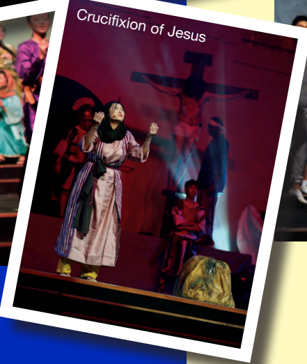
Crucifixion of Jesus