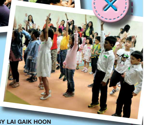
Children enjoying games time

righteousness. The Bible says, "Let us therefore come boldly to the throne of grace, that we may obtain mercy and find grace to help in time of need" (Hebrews 4:16). Thank God for His love and grace in providing us a High Priest in Jesus who understands us totally, even when no one else does.