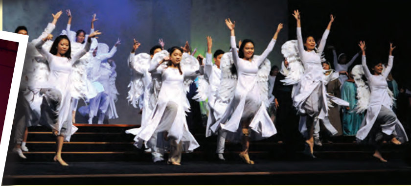
Dancing angels rejoicing