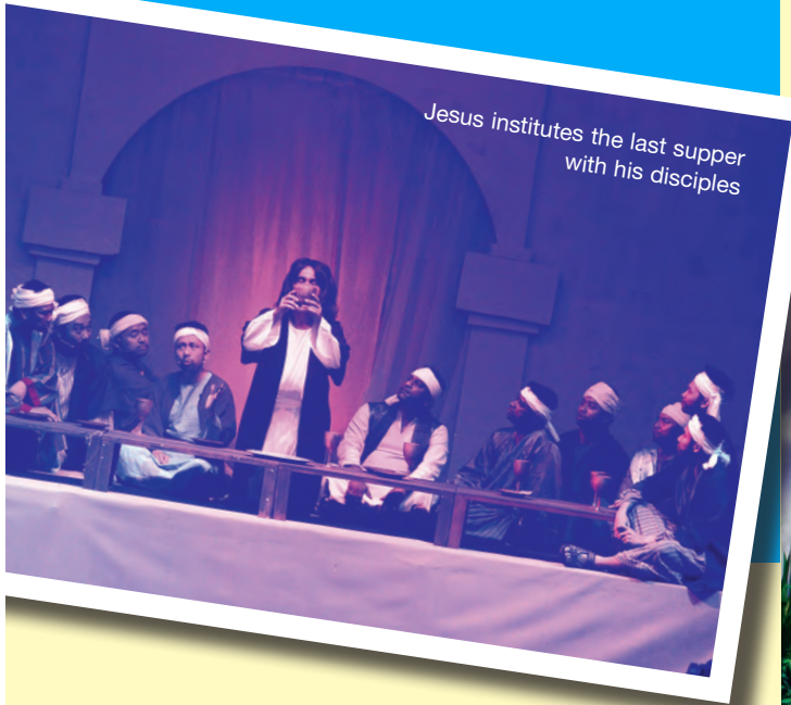
Jesus institutes the last supper with his disciples