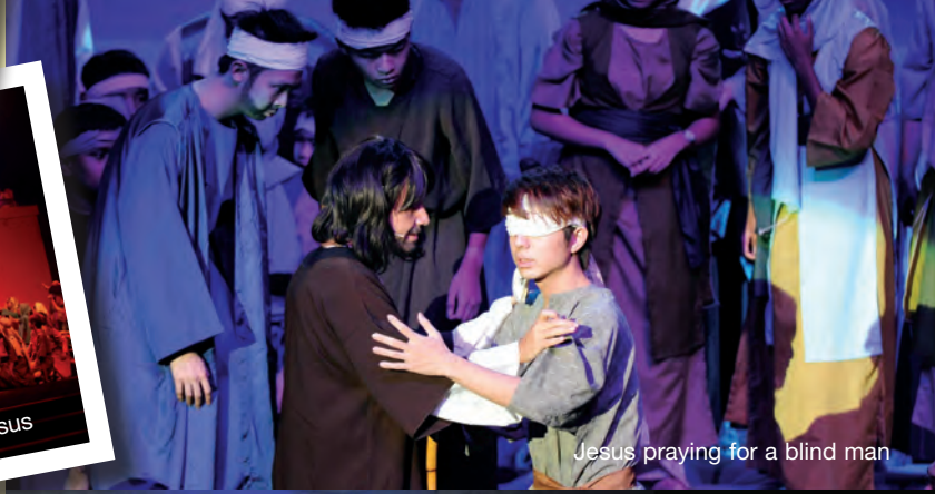
Jesus praying for a blind man