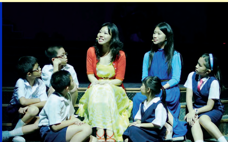
On this page, clockwise from top: Entire cast at the finale, Rejoicing and celebrating Jesus' triumphant entry to Jerusalem, Story tellers keeping audience on track through the multi-scenes