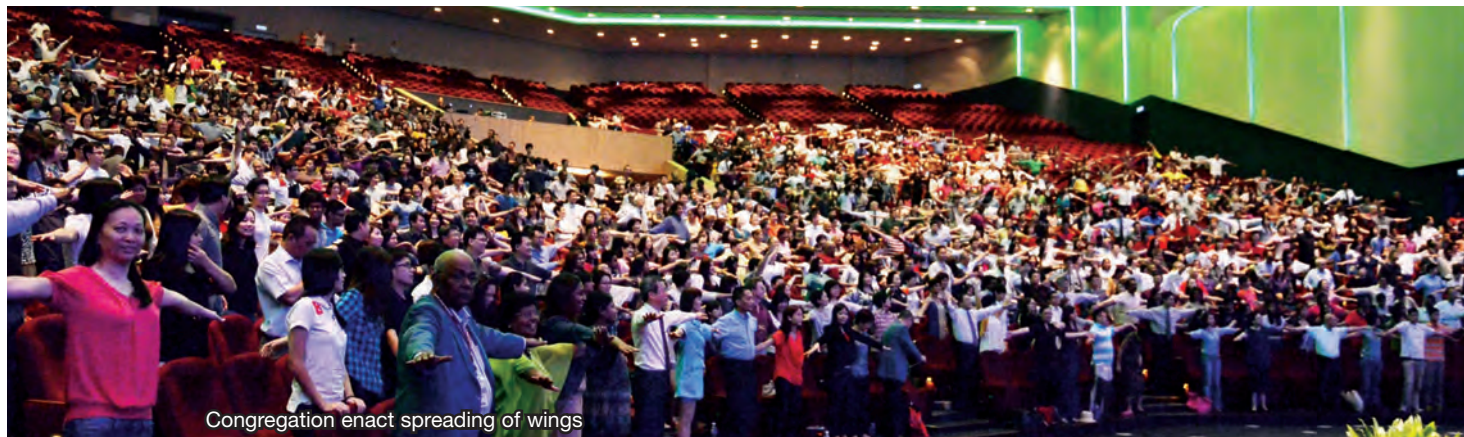
Congregation enact spreading of wings