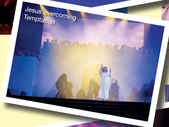
Jesus overcoming Temptation