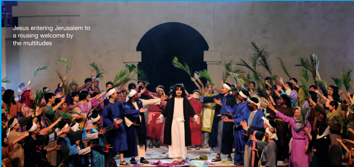
Jesus entering Jerusalem to a rousing welcome by the multitudes