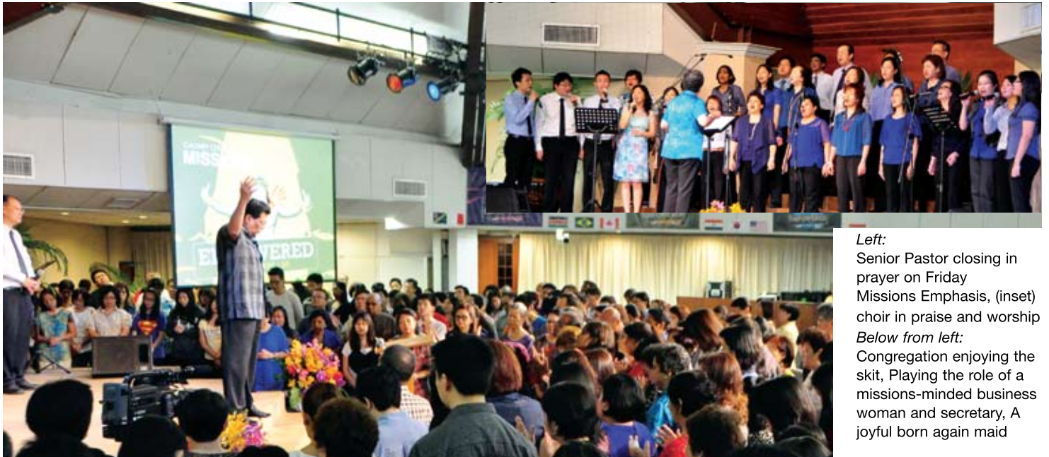
Left: Senior Pastor closing in prayer on Friday Missions Emphasis, (inset) choir in praise and worship Below from left: Congregation enjoying the skit, Playing the role of a missions-minded business woman and secretary, A joyful born again maid