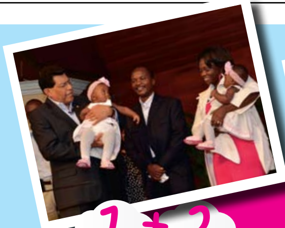
1 + 2