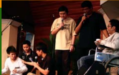
AIM students showing the difference when sharing the Gospel with the Holy Spirit's anointing