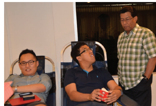
Senior Pastor encouraging two blood donors