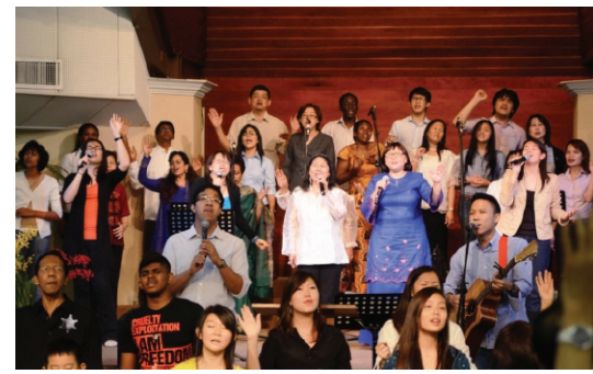
Top: Combined LG Choir and mob dance participants in praise and worship | Left: Participants giving praise and thanks to the Lord