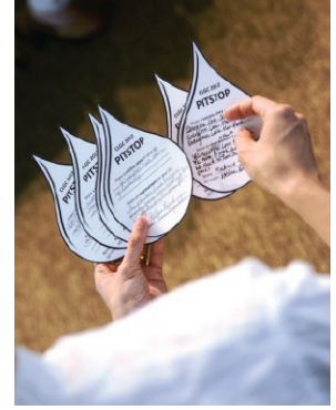
Bottom: LG action plans jotted on 'fuel cards'