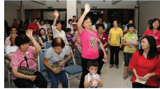
Clockwise From Left: Children's lantern parade | Participants overjoyed at their gifts | Good participation during games and fellowship time | Chinese choir's exhortation in song