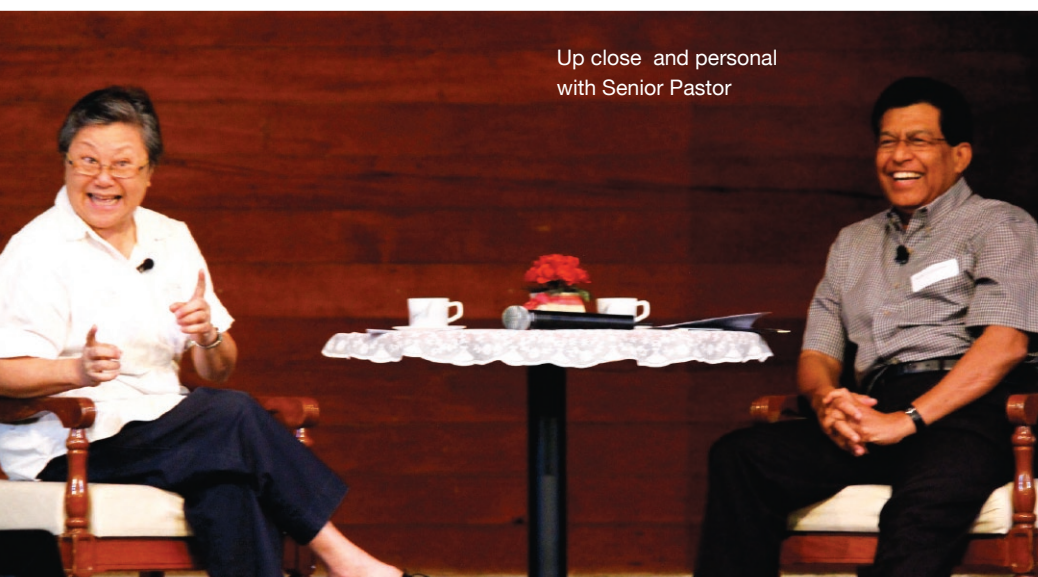
Up close and personal with Senior Pastor