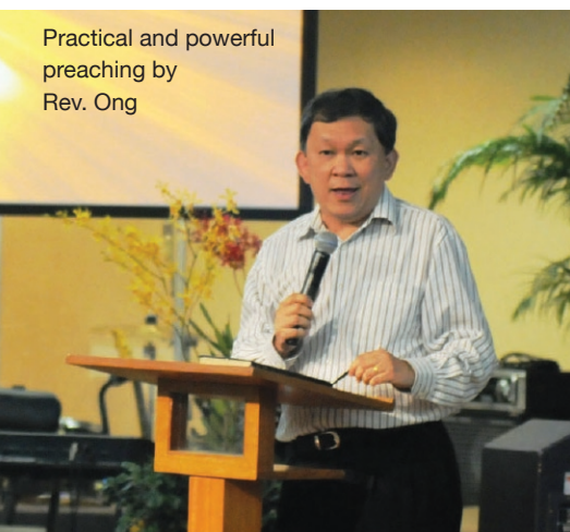
Practical and powerful preaching by Rev. Ong