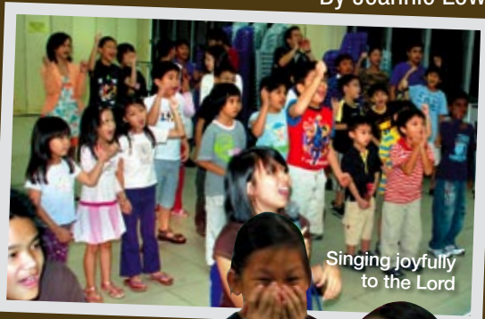
Singing joyfully to the Lord