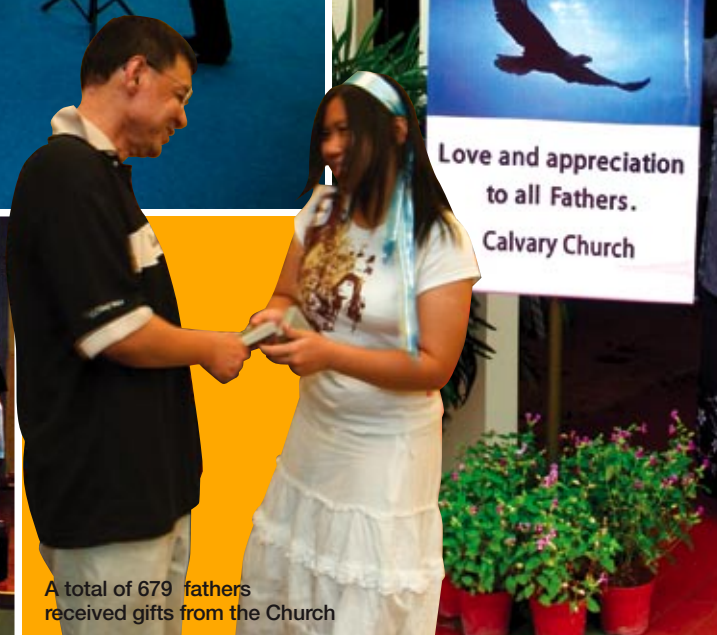
A total of 679 fathers received gifts from the Church