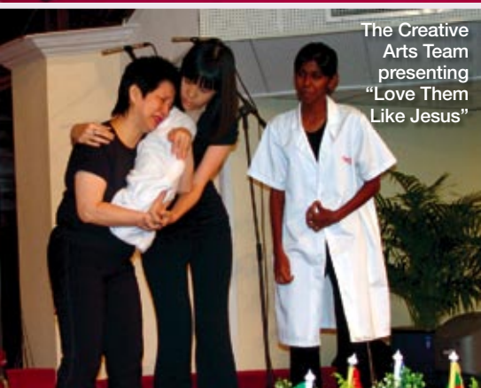
The Creative Arts Team presenting "Love Them Like Jesus"

O N FRIDAY EVENING ON 11 JULY 2008, the Missions Emphasis aptly began with a song, "Mighty to Save" by the Youth Choir and a human video with the moving refrain, "Don't need the answer to all of life's questions; Just love them like Jesus."