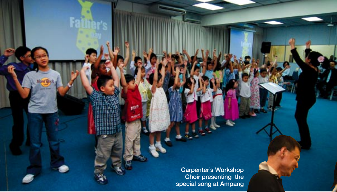
Carpenter's Workshop Choir presenting the special song at Ampang