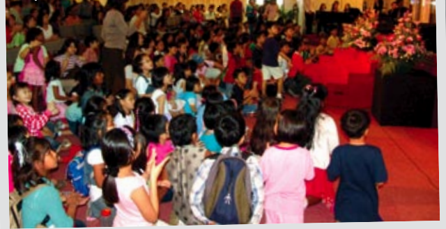
The Carpenter's Workshop children witnessing the water baptism of their classmates