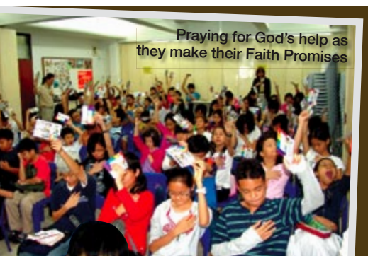
Praying for God's help as they make their Faith Promises

That Sunday, the Church made faith promises to the Lord, choosing to give and live. ✚