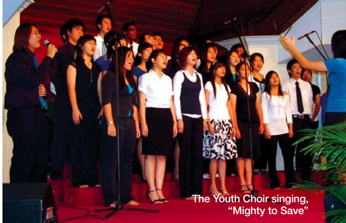
The Youth Choir singing, "Mighty to Save"