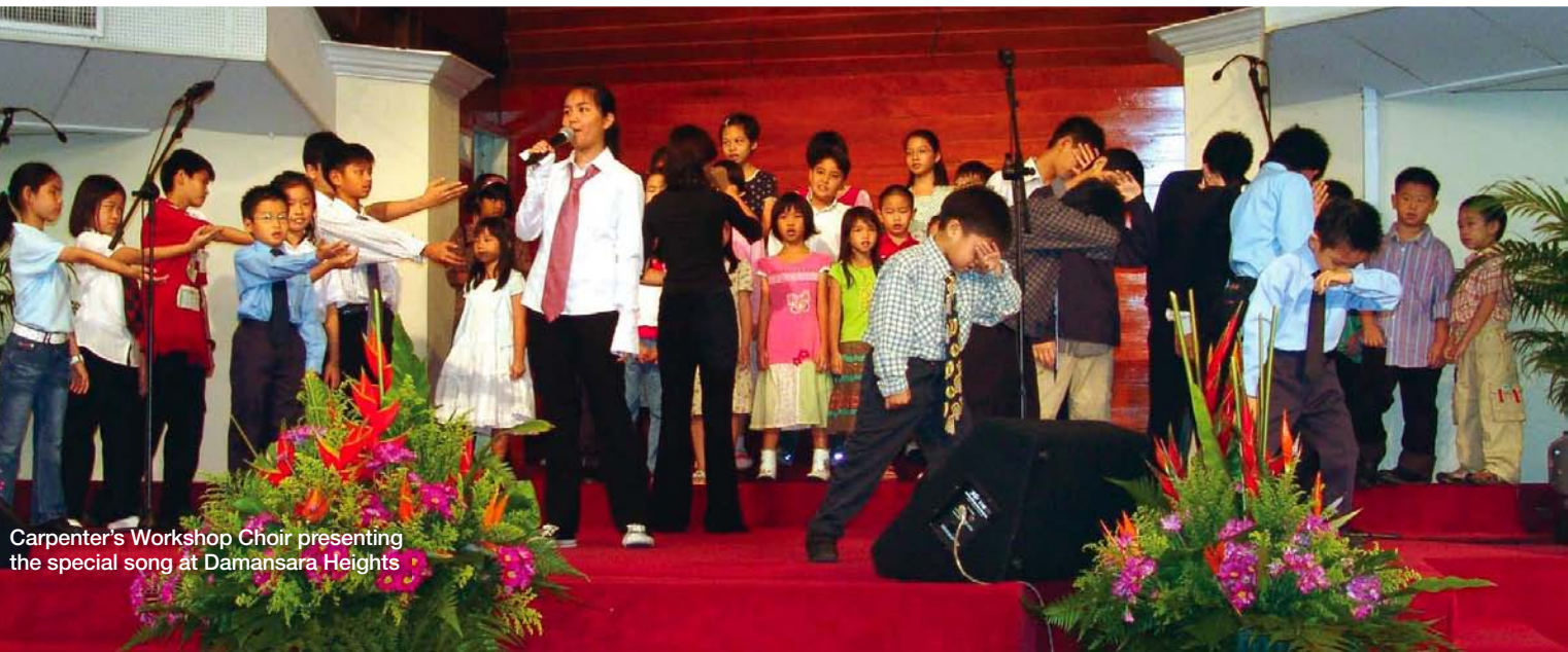
Carpenter's Workshop Choir presenting the special song at Damansara Heights

concluded his message with something for us to think about. He said that the greatest privilege in life is to know Jesus and second is to lead someone else to Him. And if they are so important, how much of our lives are devoted to these privileges?