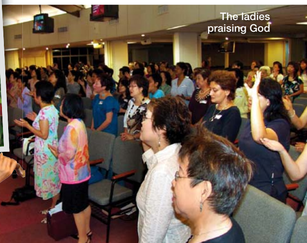
The ladies praising God