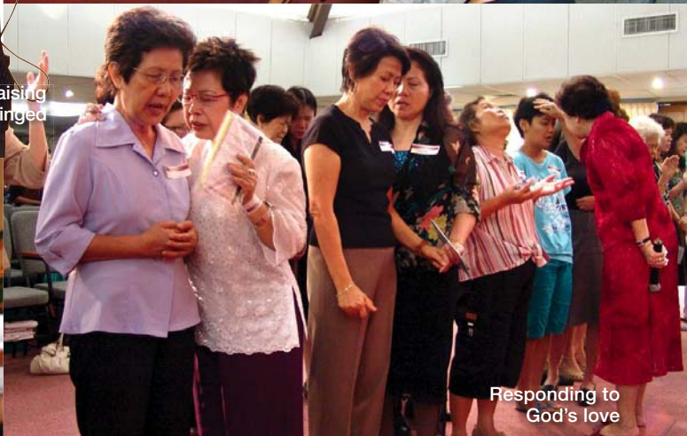
Responding to God's love