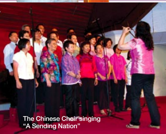
The Chinese Choir singing "A Sending Nation"