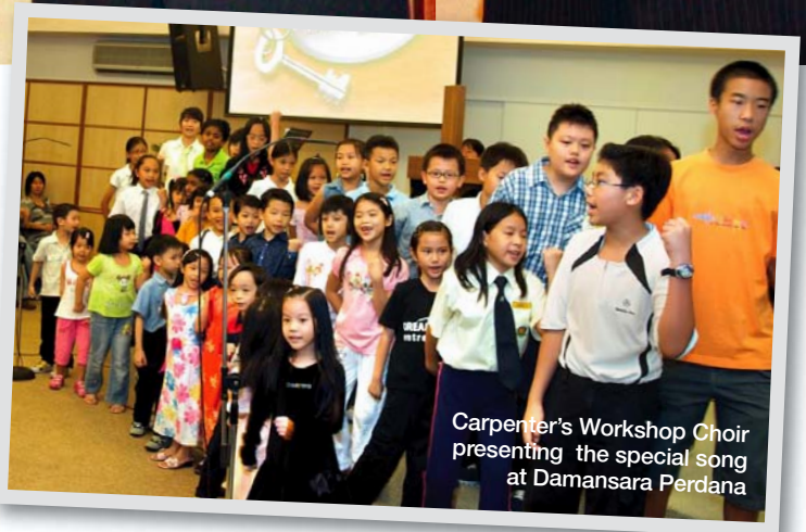
Carpenter's Workshop Choir presenting the special song at Damansara Perdana

128:3). And parents must lead their children in word and action because children are watching them all the time!