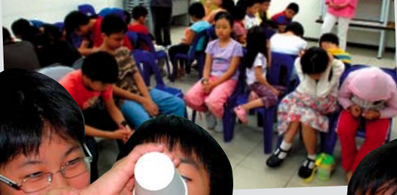
Praying for our 19 Outreaches