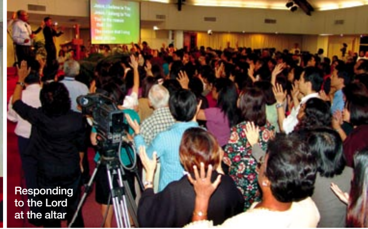
Responding to the Lord at the altar