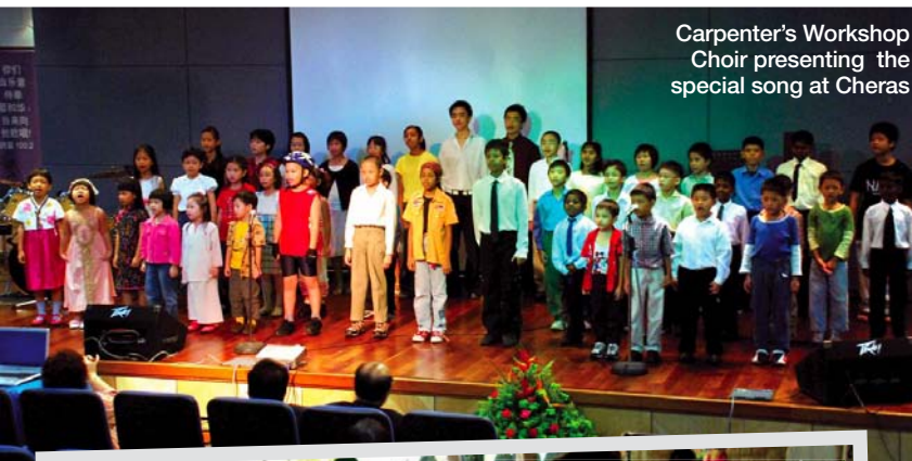
Carpenter's Workshop Choir presenting the special song at Cheras