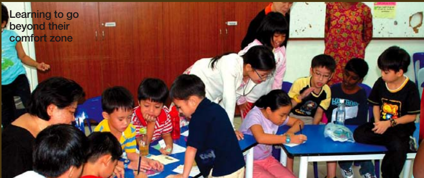
Learning to go beyond their comfort zone