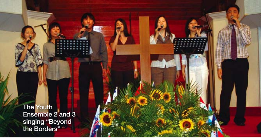
The Youth Ensemble 2 and 3 singing "Beyond the Borders"